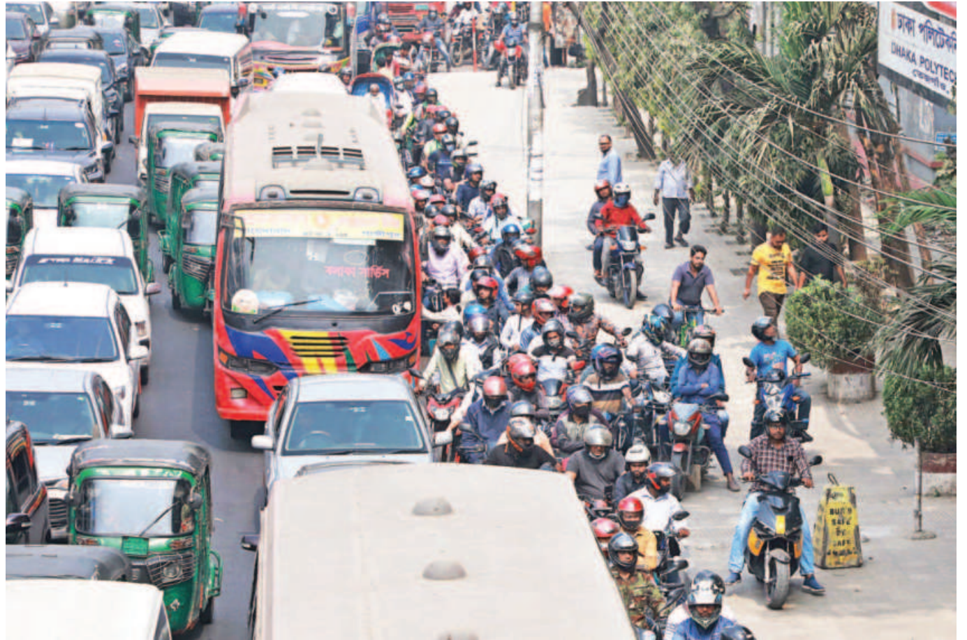
Not even the iron bars can stop some motorcyclists from riding on the footpath in front of Dhaka Polytechnic Institute in Tejgaon. Very few footpaths in the capital are free of this menace. The photo was taken yesterday.