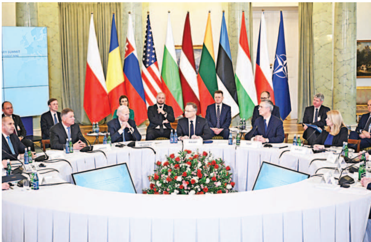
US President Joe Biden attends a Bucharest Nine (B9) meeting chaired by Polish President Andrzej Duda at the Presidential Palace in Warsaw, Poland yesterday.