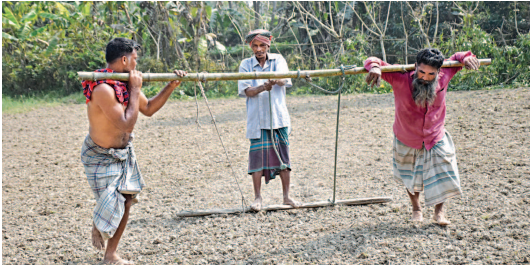
Instead of spending on a machine and purchasing its fuel, farmers use their own brute strength to level a crop field. Preparing the land after a harvest or during fallow period involves plowing to overturn the soil, harrowing to break up the chunks of soil and incorporate plant residue and finally levelling. The photo was taken at Kalyankathi village in Jhalakathi over a week ago.