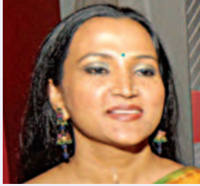
Proprietor of Jahan Metals

She is a self-made entrepreneur. She has been able to show how items deemed waste can be transformed into exportable products just through creativity and integrity.