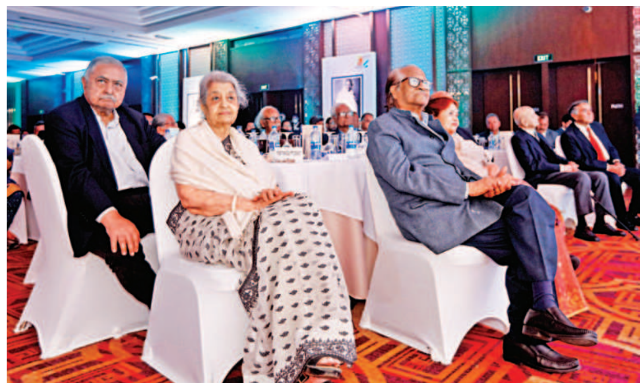
A few of the champions of freedom of thought at The Daily Star’s anniversary celebrations yesterday.

Pointing out the journey of the newspaper, he said it has come at a cost – of denigration, of maligning, of creating obstacles at every corner, non-cooperation, curtailment of advertisement, not being allowed to cover state functions at the highest levels, personalised abuse of the paper’s leadership, direct and