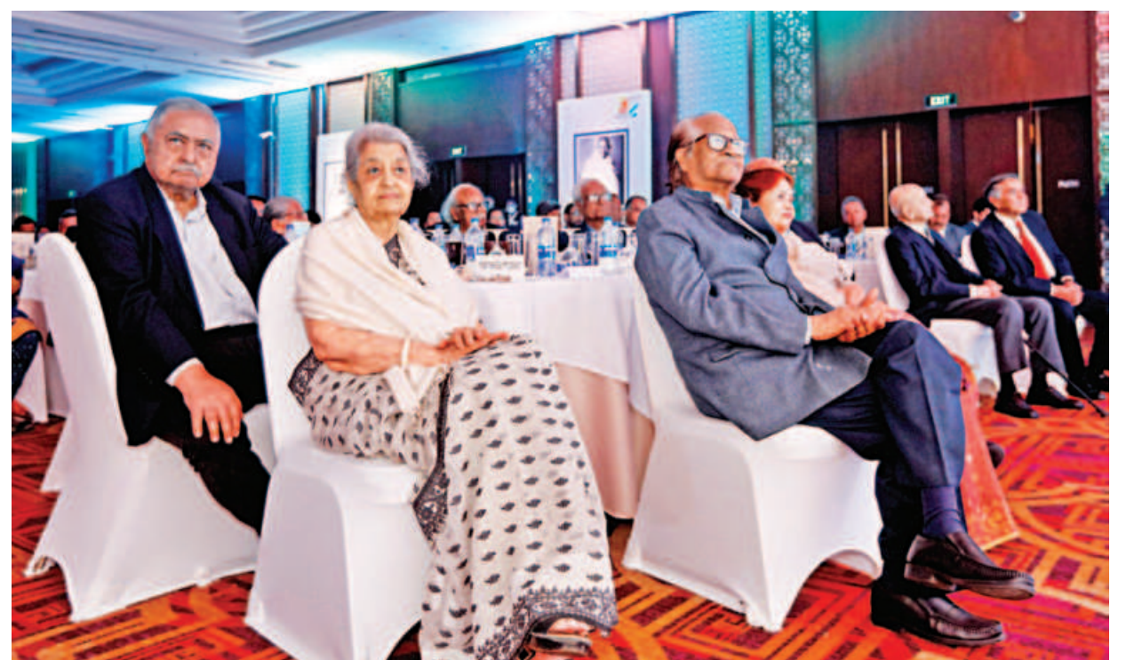
A few of the champions of freedom of thought at The Daily Star's anniversary celebrations yesterday.

Pointing out the journey of the newspaper, he said it has come at a cost -- of denigration, of maligning, of creating obstacles at every corner, non-cooperation, curtailment of advertisement, not being allowed to cover state functions at the highest levels, personalised abuse of the paper's leadership, direct and