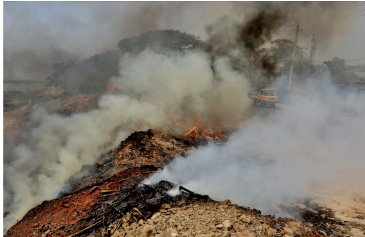
Smoke billows from plastic waste dumped beside a road in the capital's Mirpur Beribadh area. Local underprivileged youths set the waste on fire to melt the plastic and sell it to factories. This smoke not only pollutes the environment, but also puts public health at risk.