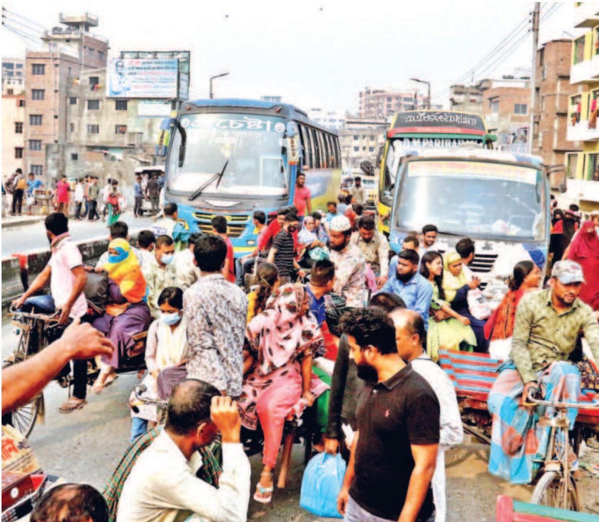
Vans have taken over the entrance to the capital's Babubazar bridge. These three-wheelers stay parked at the spot to take passengers across the bridge, and in the process, block the way for large and small vehicles. This photo was taken yesterday.

Soon after, the students placed a banner at the site of the removed sculpture which read, "Gum Hoya Gela Rabindranath" (Rabindranath has disappeared).