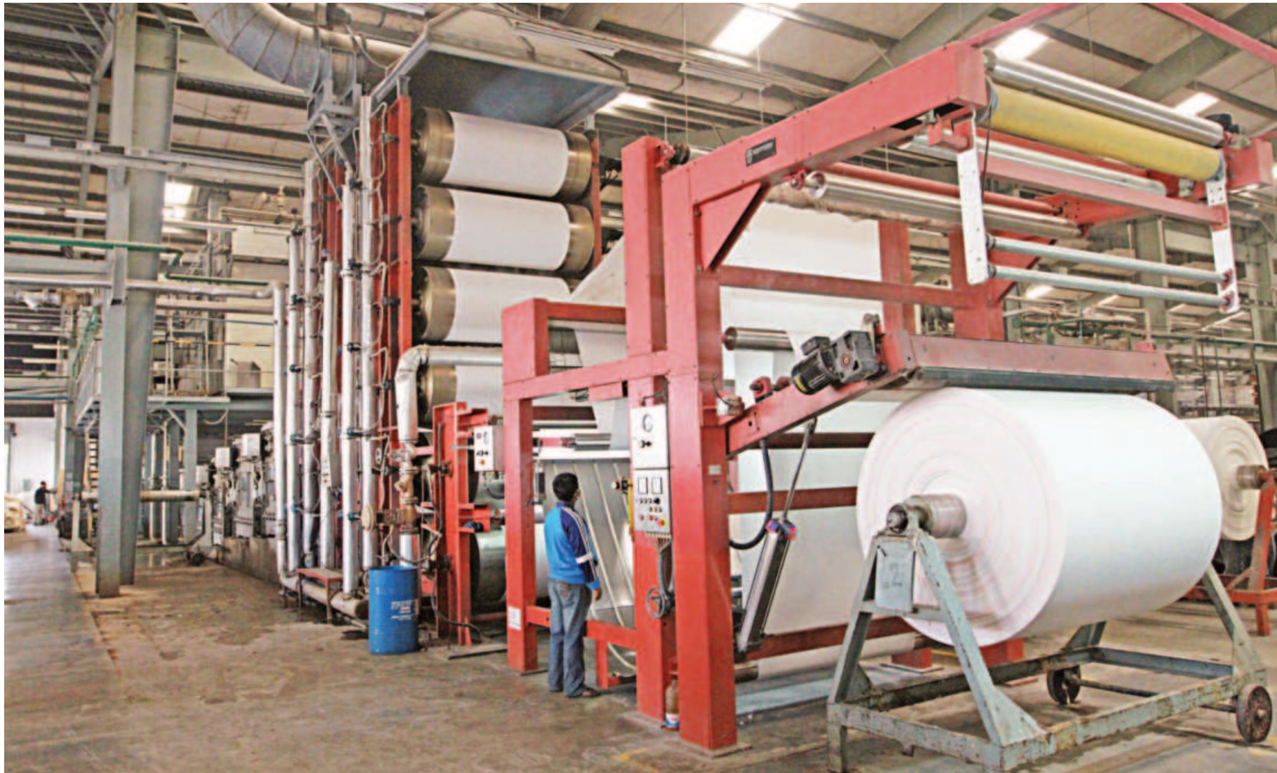
Business organisations have to renew many certificates every year, which is problematic for them, say business leaders.