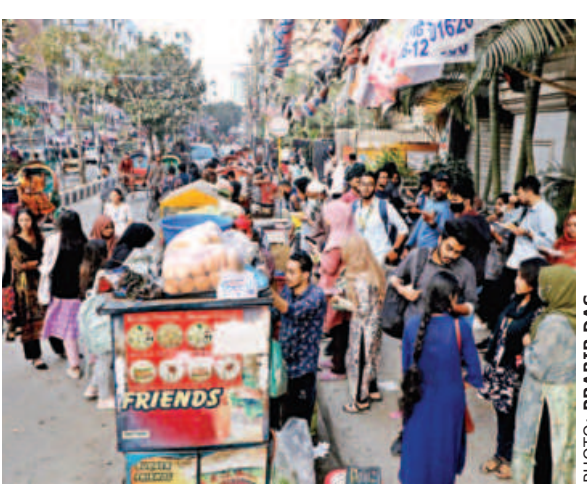
Welcome to Farmgate, where footpaths are not for pedestrians only. The footpaths from Ananda Cinema Hall to the Panthapath signal through Green Road have restaurants, book stalls, coaching-centre booths, stalls to open bank accounts, rickshaw and truck stands, tea stalls, a bazaar, dustbins, and a living space for the homeless. The one thing that is missing is ample space for pedestrians to walk on. Unfortunately, the same can be said for footpaths all around the capital. The photos were taken recently.