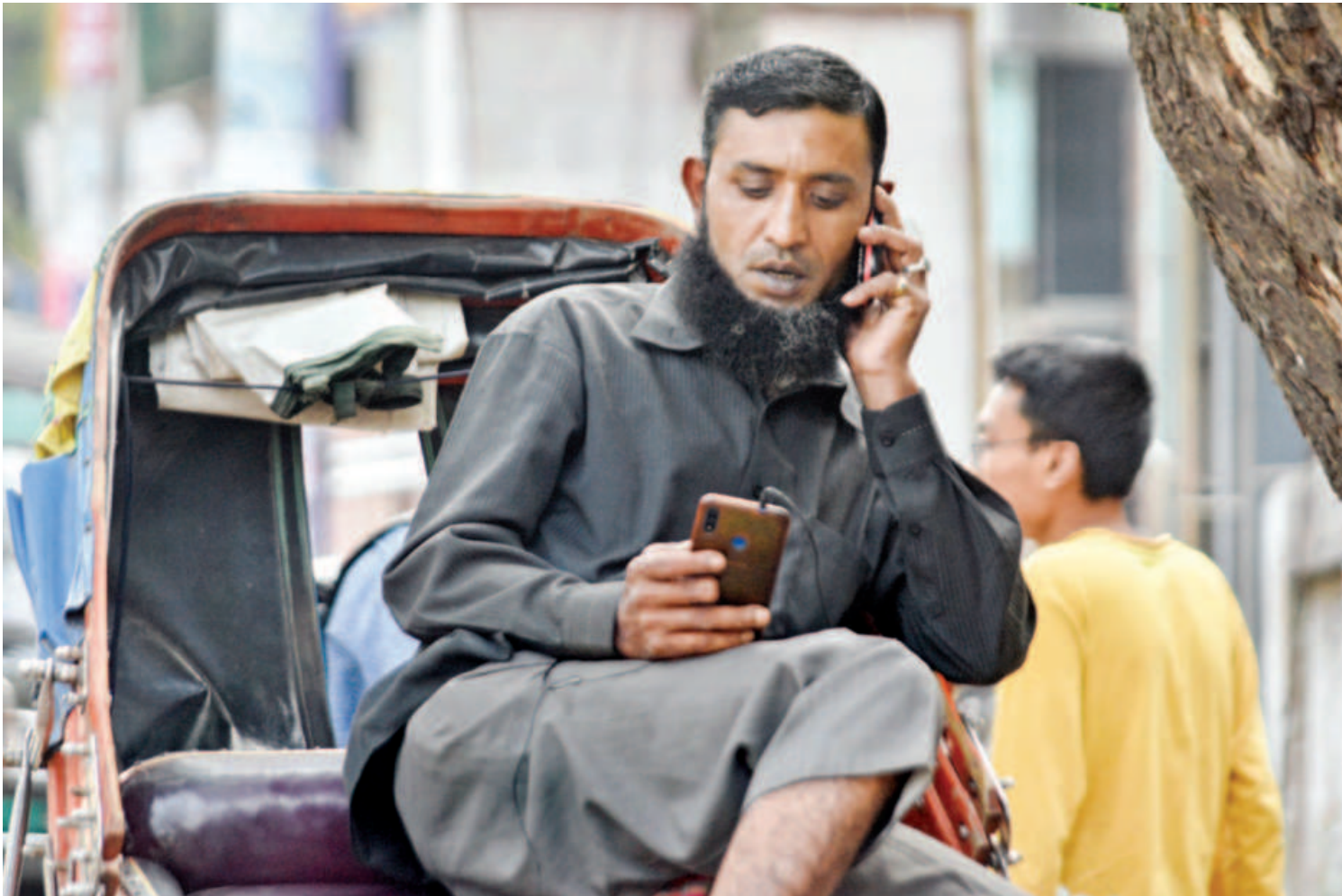
The number of mobile subscribers in Bangladesh dropped by 6 lakh to 18.02 crore in 2022.

Robi's shares were unchanged at Tk 30 on the Dhaka Stock Exchange yesterday.