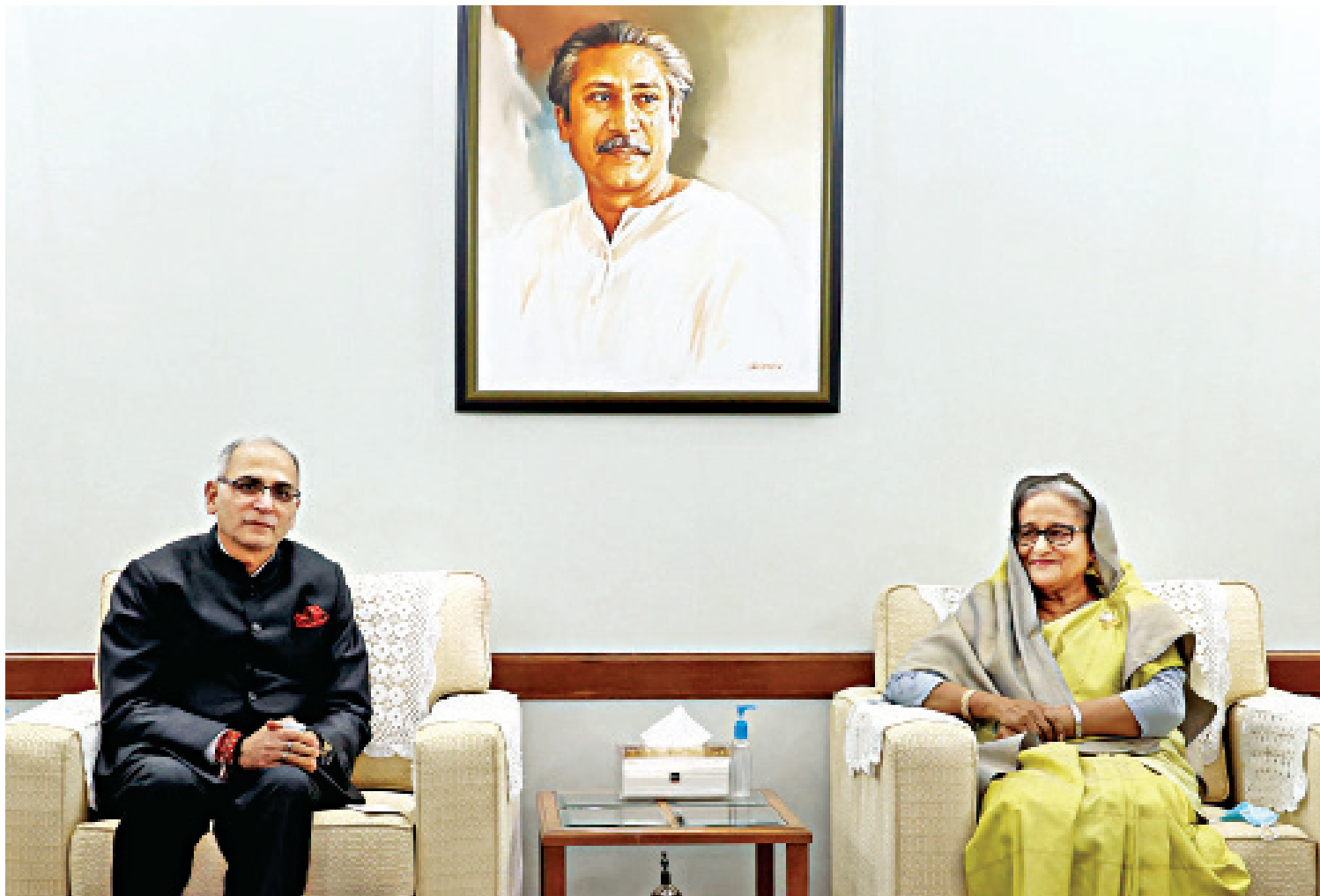
Visiting Indian Foreign Secretary Vinay Kwatra calls on Prime Minister Sheikh Hasina at the Gono Bhaban yesterday. Kwatra invited the prime minister to attend the 18th G20 Summit in New Delhi on September 9-10.