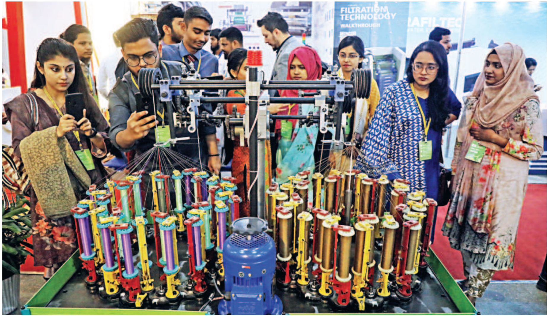
Visitors observe the workings of machinery on the opening day of the 17th Dhaka International Textile & Garment Machinery Exhibition 2023 at International Convention City Bashundhara in Dhaka yesterday. Bangladesh Textile Mills Association, Yorkers Trade & Marketing Service Company, Hongkong, and Chan Chao Int'l Company, Taiwan are jointly organising the exposition.