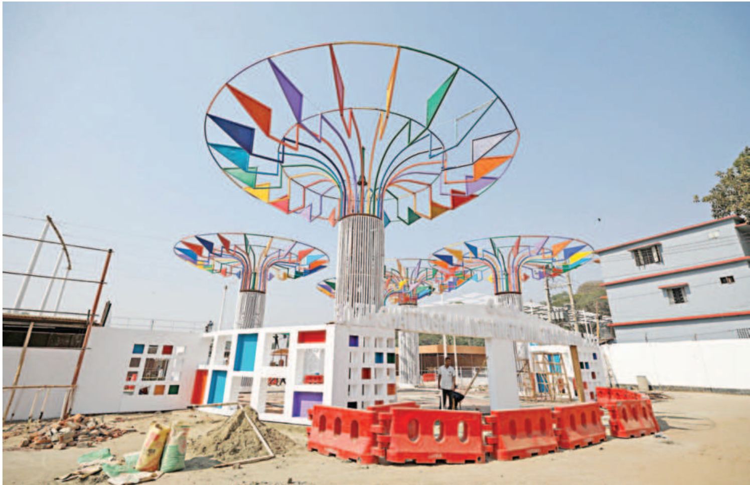
Preparations are underway by the Chittagong Chamber of Commerce and Industry to host the Chattogram International Trade Fair on the Railway Pologround in the port city. The fair begins today to promote domestic products at home and abroad.

Besides, a Turkish company will supply 8,000 tonnes of lentil to the state-run TCB.