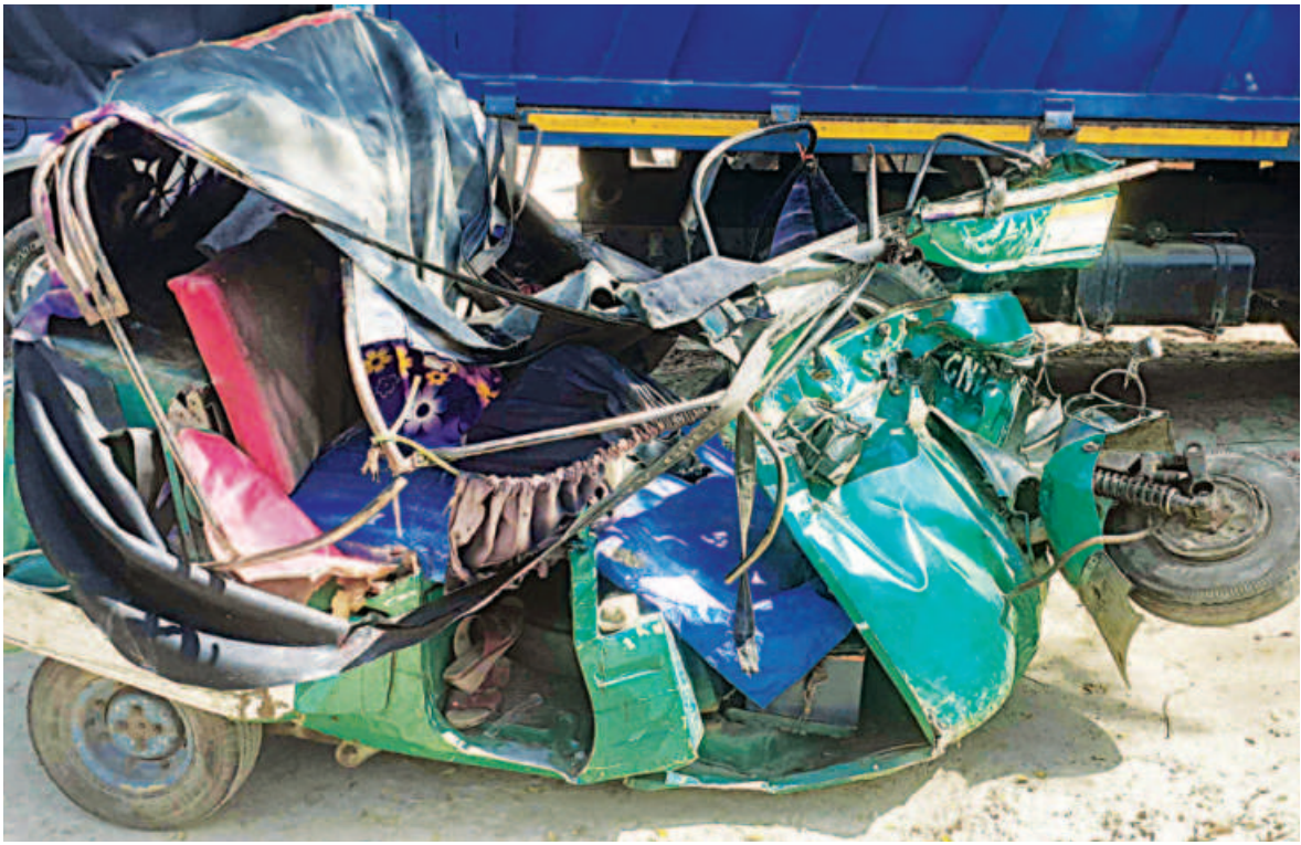
The mangled remains of a CNG-run autorickshaw after it collided head-on with a truck on Joypurhat-Bogura regional highway in Joypurhat's Khetlal yesterday morning. Five passengers of the three-wheeler died in the crash. Bottom, a truck skidded off and overturned beside Cox's Bazar-Teknaf Marine Drive on Sunday night, killing a man.