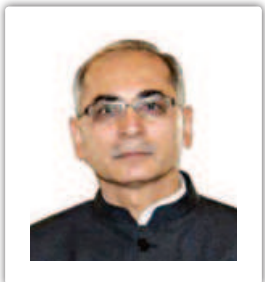
Vinay Mohan Kwatra