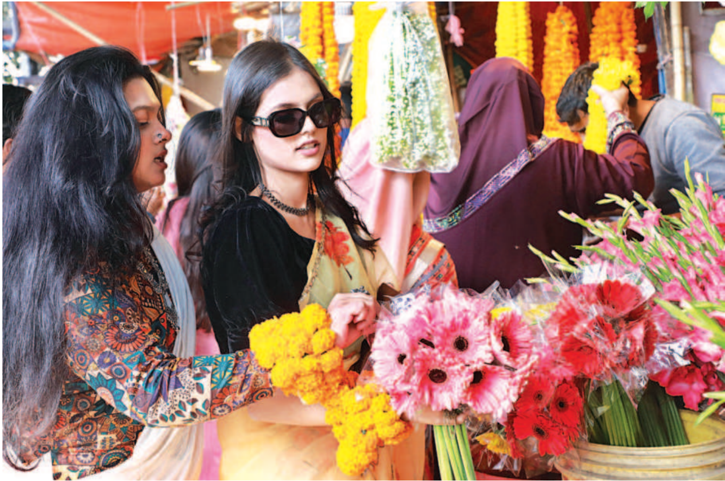
Women browsing flowers at a shop in the capital's Shahbagh on the eve of Pahela Falgun, the first day of spring, yesterday. Flower shops were busy making bouquets and garlands for buyers who came by, but the sale was very low due to high prices. Pahela Falgun coincides with Valentine's Day.