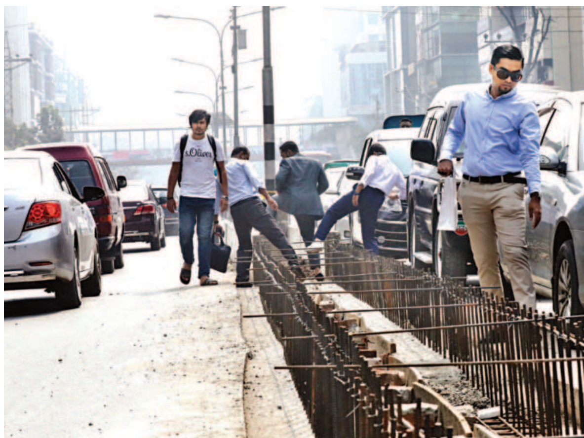
A footbridge is not far, but people are choosing to walk through the obstacles of the under-construction road divider to go across Sat Masjid Road in the capital. Besides, the risk of getting pierced by the pointy rods, they also risk being runover by vehicles.

The discovery was made by an international team of astronomers using HiPERCAM – an extremely sensitive high-speed camera developed by scientists at the University of Sheffield.