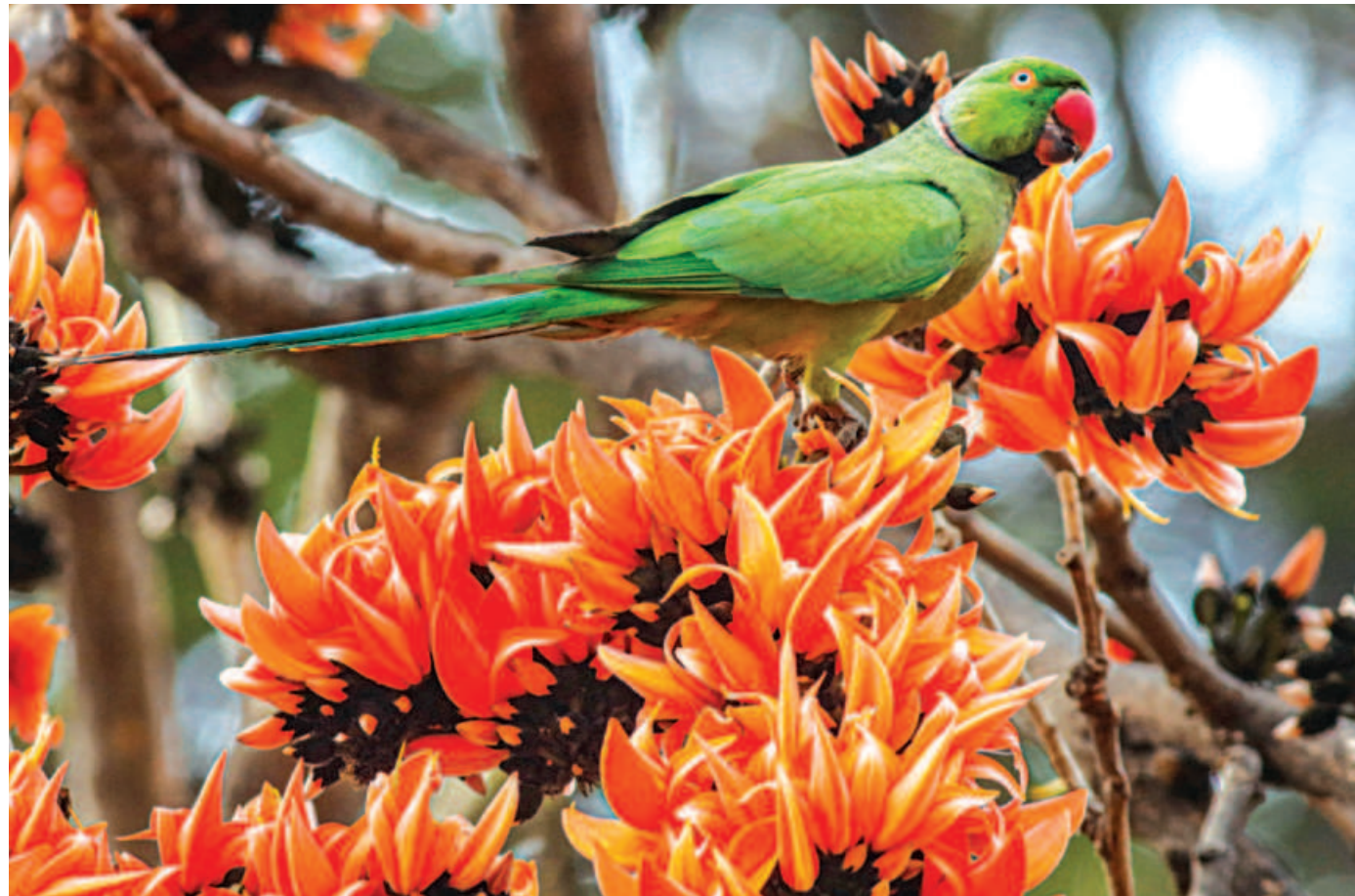
A SPRINGTIME SPECIAL ... A parakeet welcomes spring by surrounding itself with an abundance of strikingly-coloured krishnachura flowers, known as royal poinciana or flamboyant in English. With this season, comes the blooming of various special flowers – belli, kathgolap, sheuli, shimul and more – adorning the entire country with a fragrant, colourful aura.