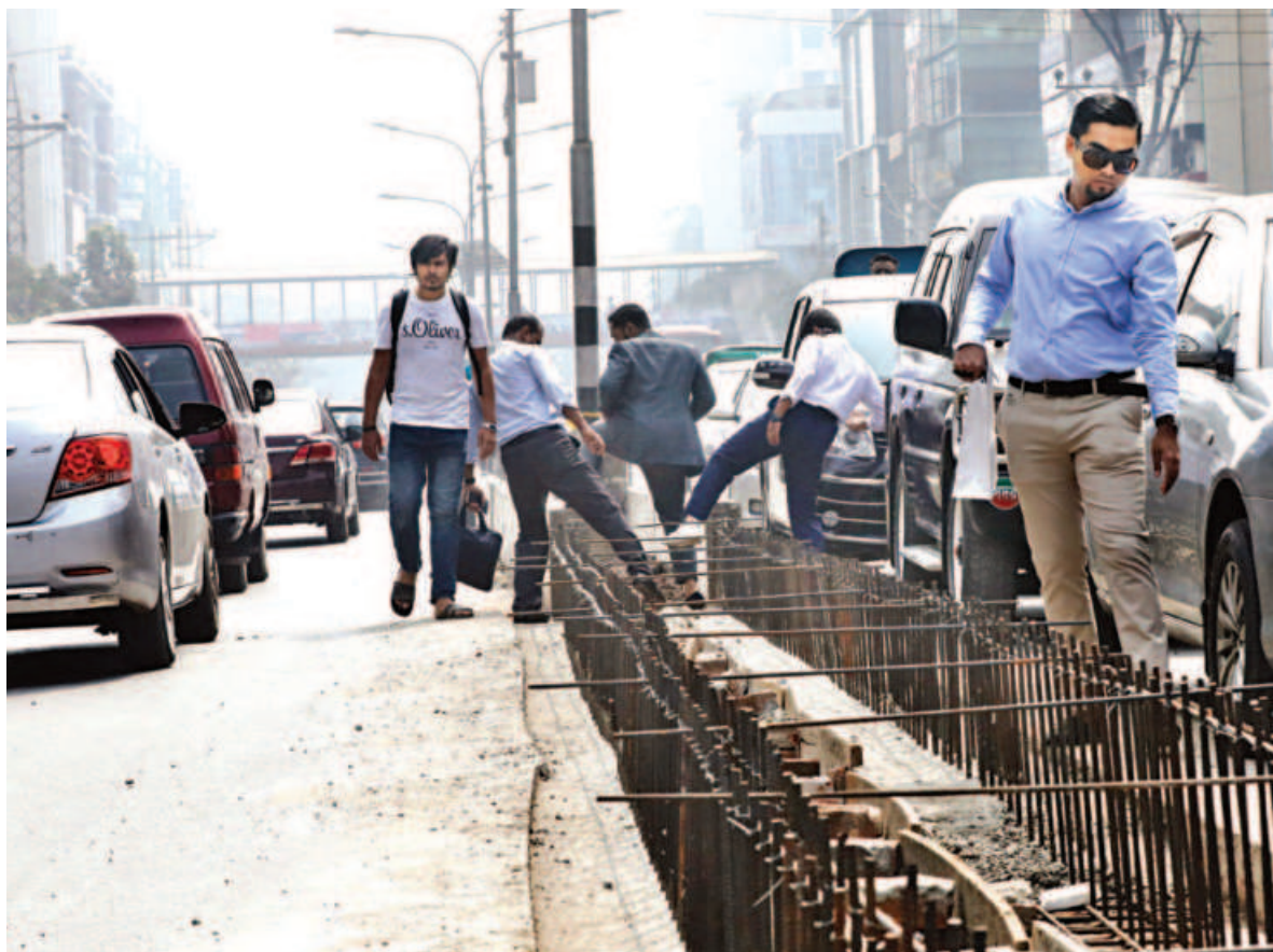
A footbridge is not far, but people are choosing to walk through the obstacles of the under-construction road divider to go across Sat Masjid Road in the capital. Besides, the risk of getting pierced by the pointy rods, they also risk being runover by vehicles.

The discovery was made by an international team of astronomers using HiPERCAM – an extremely sensitive high-speed camera developed by scientists at the University of Sheffield.