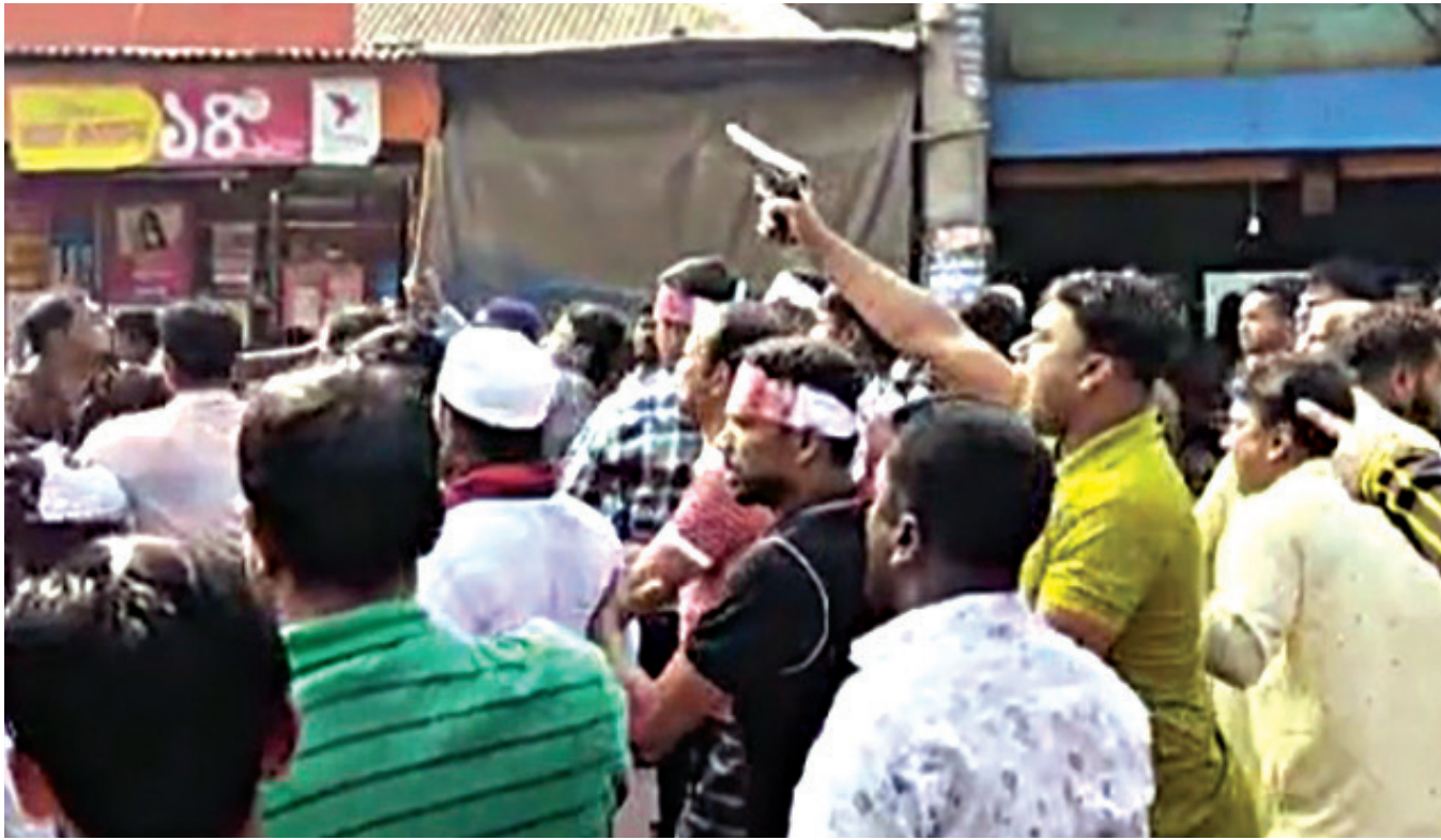
A man brandishing a firearm from a BNP procession at Bormi Bazaar in Sreepur upazila of Gazipur yesterday. Local Awami League activists say the man is a BNP activist while the latter maintains that he is not.