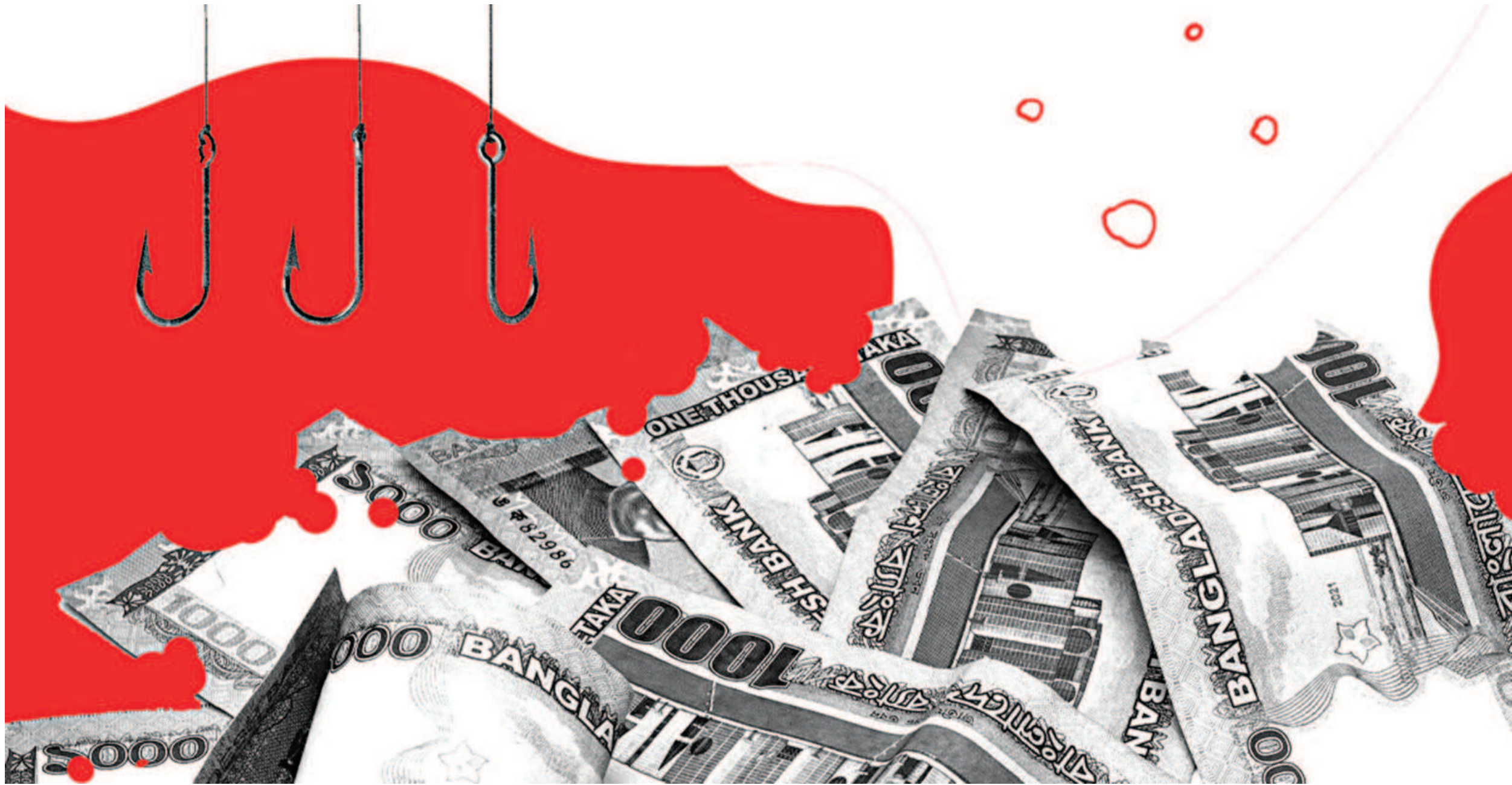
VISUAL: SALMAN SAKIB SHAHRYAR