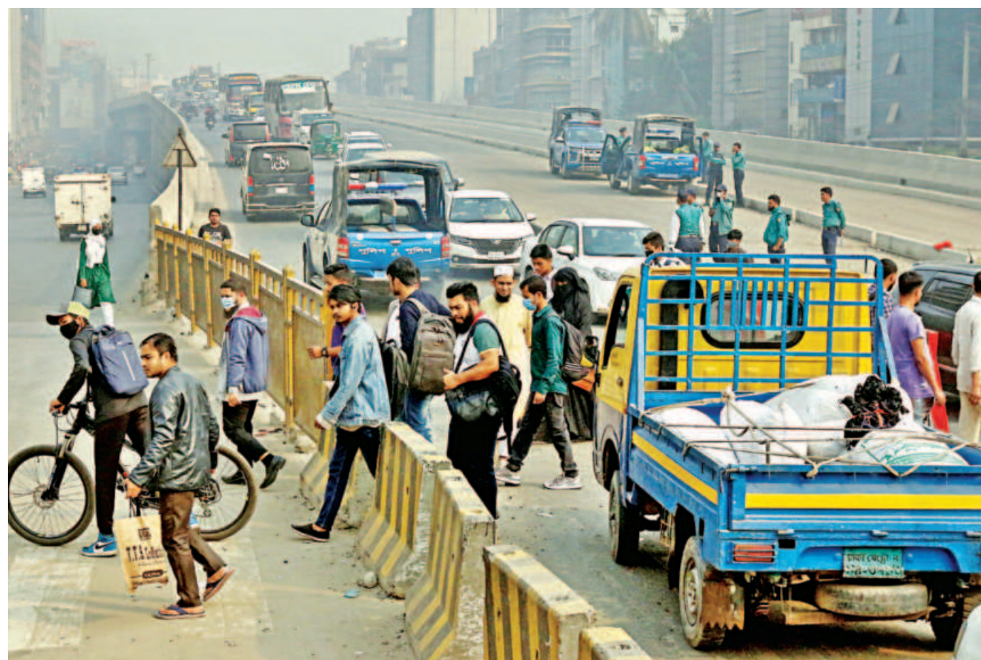
Risking life and limb, people are jaywalking on a flyover in the capital's Uttara while police personnel are seen nearby. The flyover from Tongi to Uttara, being constructed under a BRT project, has partially been opened to traffic. The photo was taken on Thursday.