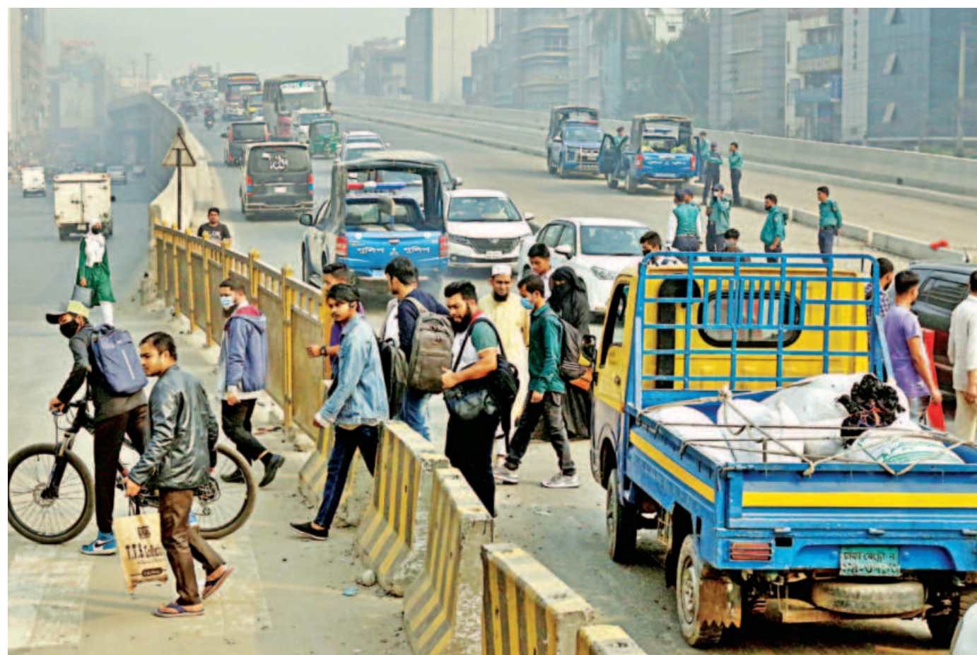
Risking life and limb, people are jaywalking on a flyover in the capital’s Uttara while police personnel are seen nearby. The flyover from Tongi to Uttara, being constructed under a BRT project, has partially been opened to traffic. The photo was taken on Thursday.