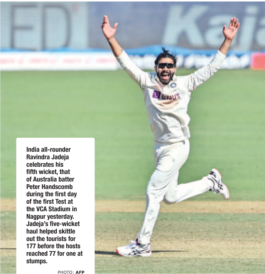
India all-rounder Ravindra Jadeja celebrates his fifth wicket, that of Australia batter Peter Handscomb during the first day of the first Test at the VCA Stadium in Nagpur yesterday. Jadeja's five-wicket haul helped skittle out the tourists for 177 before the hosts reached 77 for one at stumps.

A22 said there were 10 principles that emerged from the discussions, including improving competitiveness, financial sustainability and fan experience.