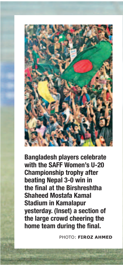
Bangladesh players celebrate with the SAFF Women's U-20 Championship trophy after beating Nepal 3-0 win in the final at the Birshreshtha Shaheed Mostafa Kamal Stadium in Kamalapur yesterday. (Inset) a section of the large crowd cheering the home team during the final.