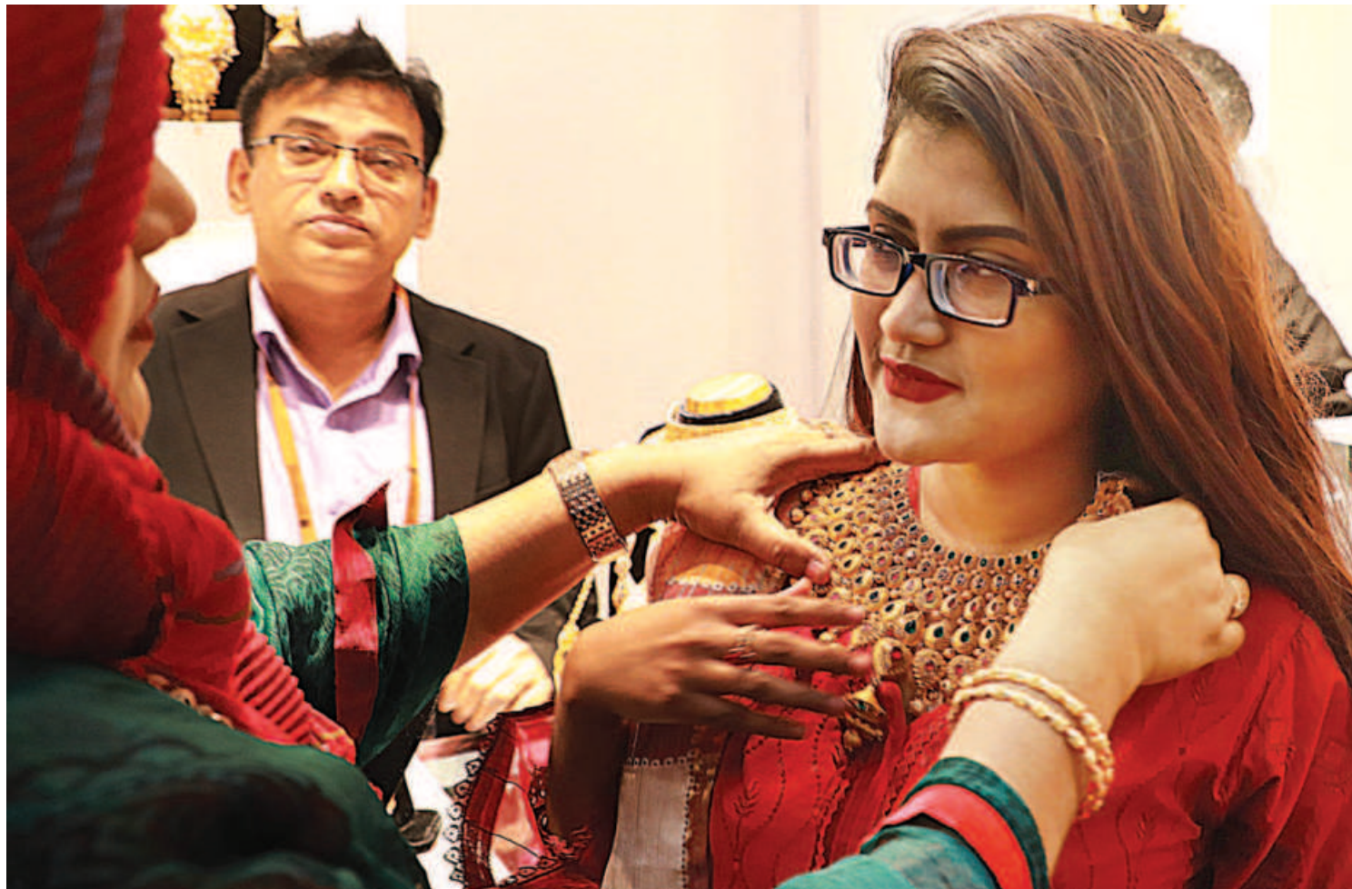
Showcasing of the latest designs will give the country a better standing in the global gold jewellery trade and thereby improve the local industry, says Bangladesh Jeweller's Association (Bajus), the organiser of Bajus Fair-2023, which opened yesterday and will also run today and tomorrow from 10:00am to 9:00pm. The photo was taken at International Convention City Bashundhara.