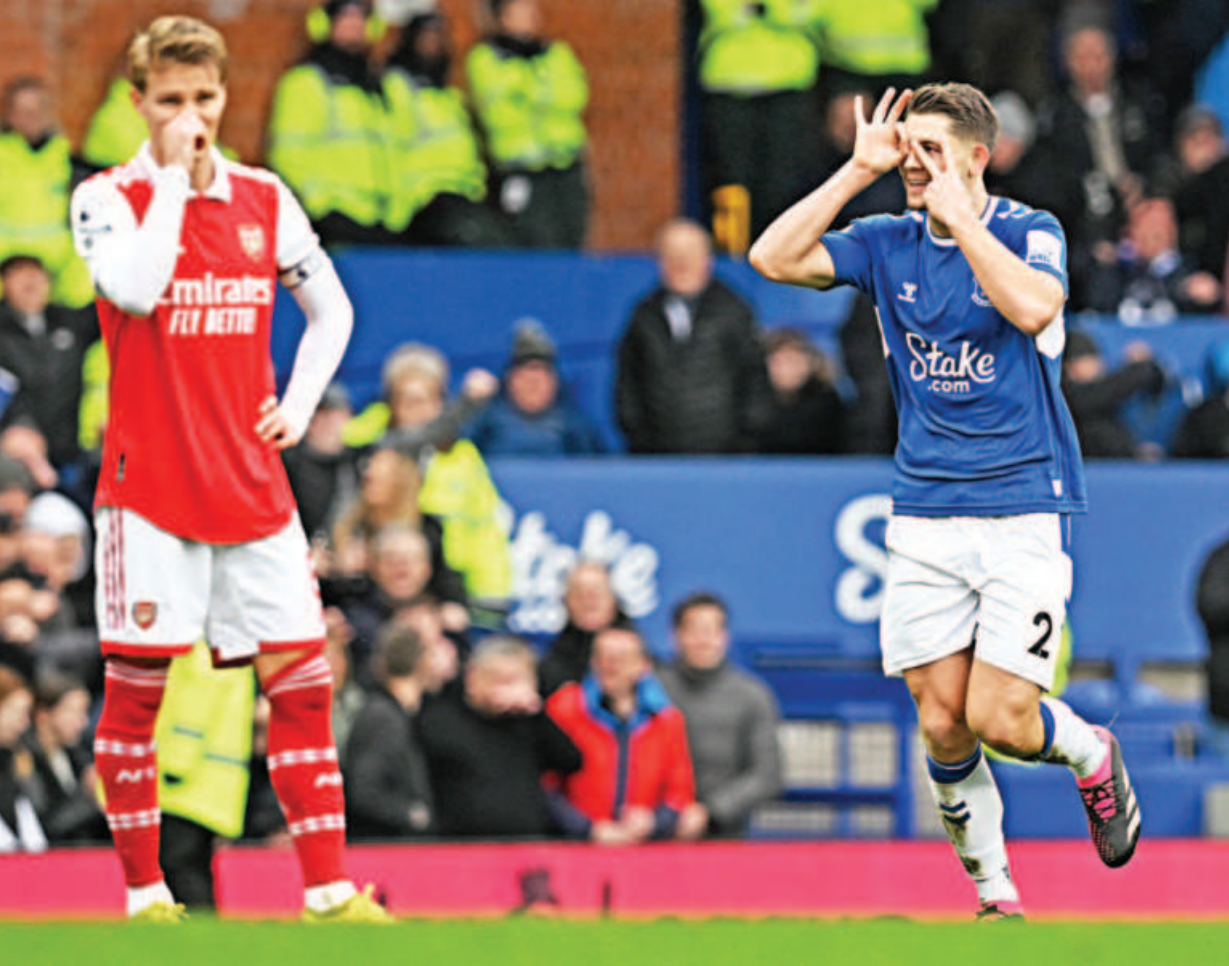
James Tarkowski celebrates after his header gave Everton the perfect start under new manager Sean Dyche, beating Premier League leaders Arsenal 1-0 at Goodison Park yesterday. This was Arsenal's second defeat of the season while Everton got out of the relegation zone with their first win in 11 games.

Conte joins long-term absentee Lucas Moura, who is still struggling with a tendon problem, in the treatment room while Richarlison is available after recovering from injury. On whether fullback Pedro Porro, who signed for Spurs on loan from Sporting Lisbon on deadline day, could make his debut, Stellini said the 23-year-old could be in contention.