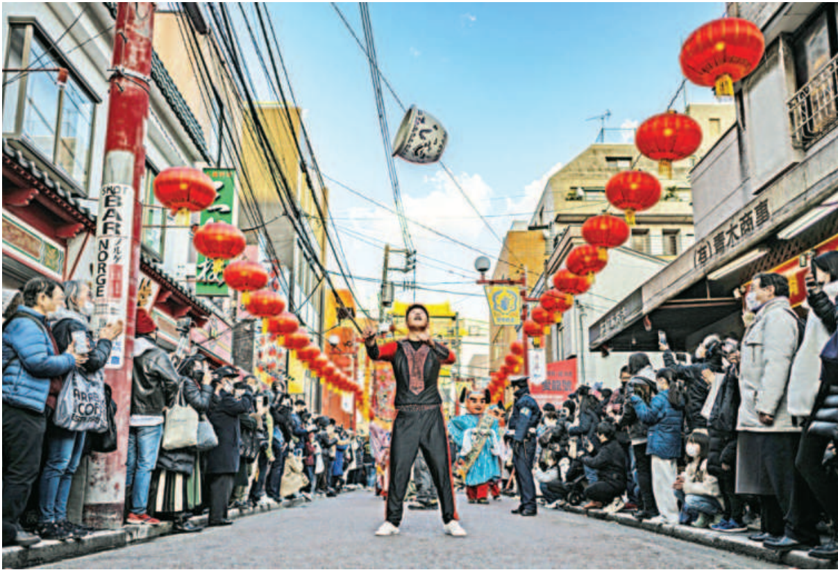
A man performs during a Lunar New Year parade, held for the first time following a three-year hiatus due to the coronavirus pandemic, in the Chinatown area of Yokohama, Japan, yesterday.

REUTERS, Washington The Biden administration is in talks with Indian officials over a possible White House visit by Prime Minister Narendra Modi later this year, according to a US official aware of the discussions and another person briefed on the matter. US President Joe Biden is eager to deepen ties with the world’s largest democracy as part of his bid to win what he has framed as a contest between free and autocratic societies, especially China. Dates are not finalized, the sources said. Discussions about a possible White House visit intensified this week as Indian National Security Adviser Ajit Doval met with his US counterpart, Jake Sullivan, and Secretary of State Antony Blinken in Washington. During the visit, the United States and India launched a partnership to deepen ties on military equipment, semiconductors and artificial intelligence. Washington has been pushing New Delhi to do more to punish Russia for the Ukraine invasion.