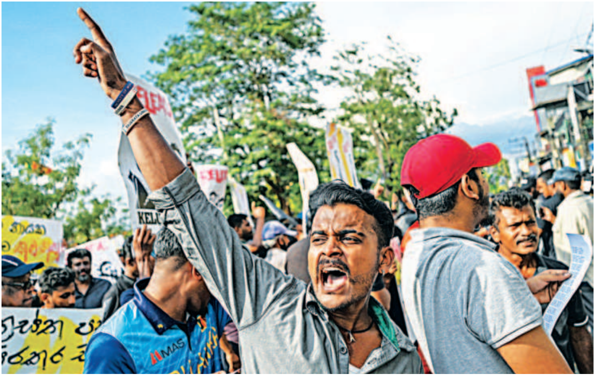
Anti-government demonstrators shout slogans as they take part in a protest demanding the release of Inter-university Students’ Federation leaders in Colombo, yesterday. Sri Lanka marked 75 years since independence with a sombre military parade yesterday, as its president urged reflection on past “errors and failures” at a time of national crisis.