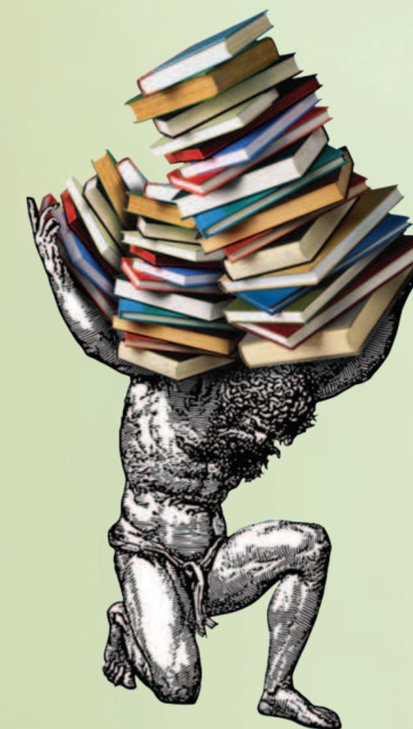
ILLUSTRATION: ABIR HOSSAIN

Some of the guidelines provided during orientation classes and actively throughout the admission coaching period are no less ludicrous. Repeatedly advising