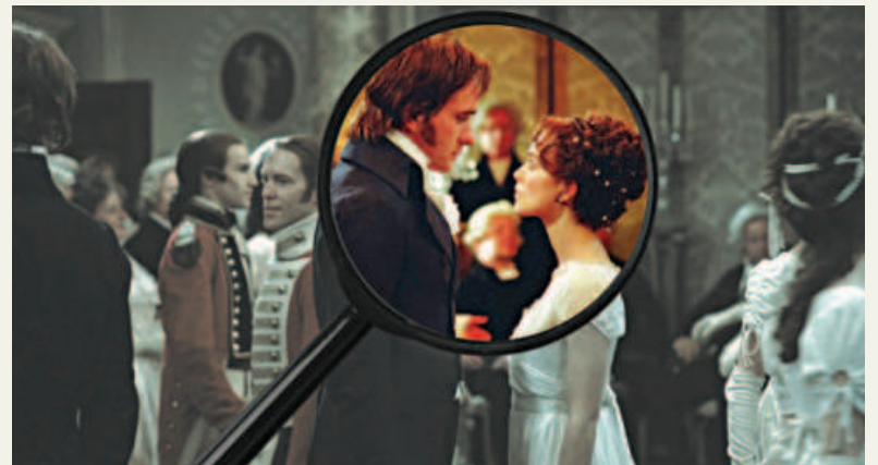
DESIGN: SYEDA AFRIN TARANNUM

If we hold our modern perspective and our sociocultural beliefs to the same rigorous standards, it is almost certain that we would come to hate every product of the past. Even if we could somehow get past these inhibitions, our discomfort regarding the outdated ways of thinking means that its value will depreciate for us. Characters, incidents, and the product itself will mean less to the audience. It will seem much shallower than it really is.