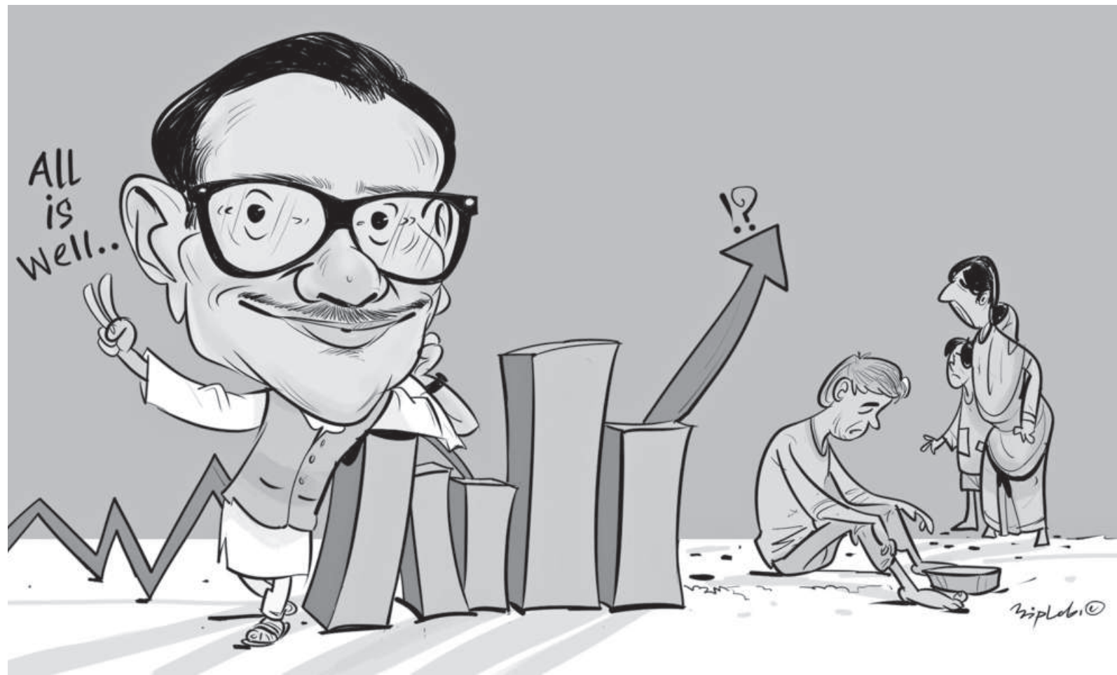
ILLUSTRATION: BIPOB CHAKROBORTY

Bangladesh has the lowest spending in the education sector in South Asia. If we look at the budgets of the last three or four years, Bangladesh's budgetary spending for education has been around two percent of GDP. It was 2.09 percent in FY21 budget, 2.08 percent in FY22, and 1.83 percent in FY23.