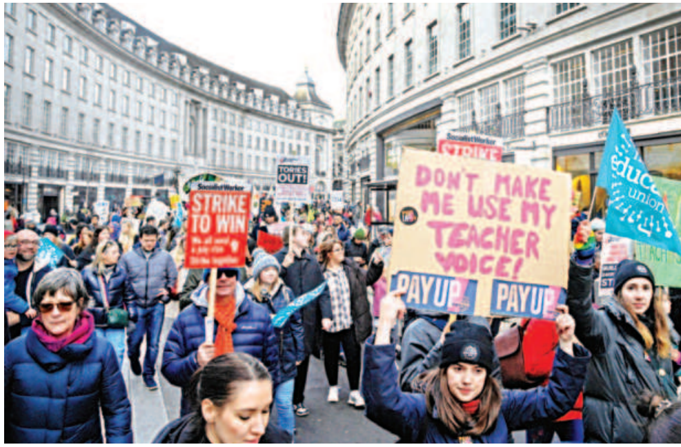
Striking workers attend a march, in London, Britain. Half a million workers went on strike in Britain yesterday, calling for higher wages in the largest such walkout in over a decade, closing schools and severely disrupting transport.

India plans to spend near 242 billion rupees ($3 billion) for naval fleet construction and 571.4 billion rupees ($7 billion) for air force procurements including more aircraft, the latest budget document showed.