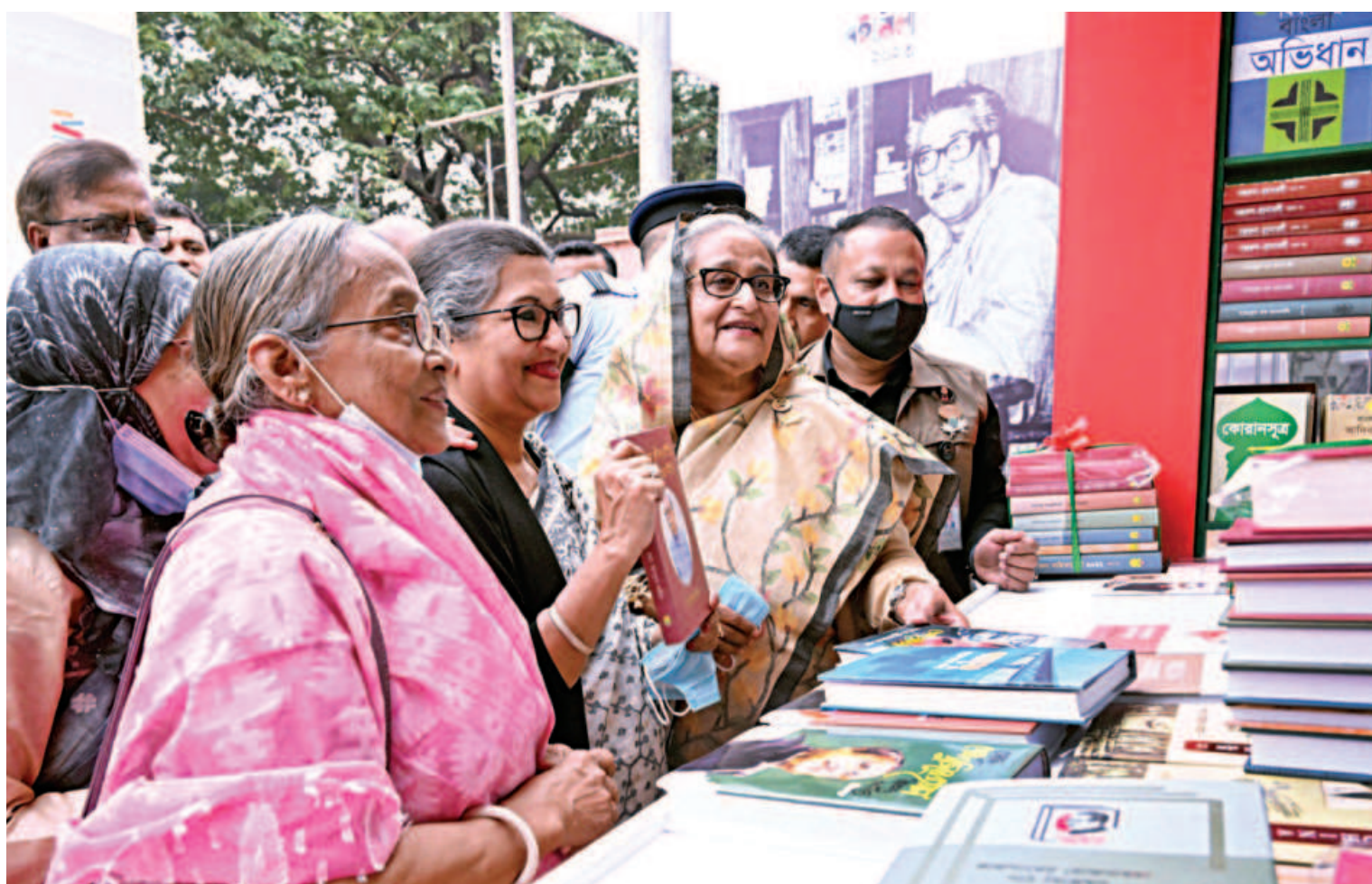
Prime Minister Sheikh Hasina enquires about newly published books while her sister Sheikh Rehana poses with a book authored by President Abdul Hamid while visiting a stall at the Ekushey Boi Mela in the capital's Suhrawardy Udyan yesterday. After inaugurating the fair, the PM, also accompanied by Bangla Academy President and novelist Selina Hossain, made rounds and visited the stalls of various publishing houses.