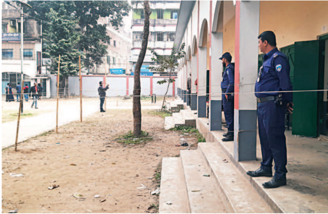
The polling station in Annada Government High School in Brahmanbaria's Sarail upazila was almost empty even half an hour after voting had begun for the Brahmanbaria-2 by-polls. The photo was taken around 9:00am. Apart from this, five other constituencies in different districts went to by-elections yesterday.