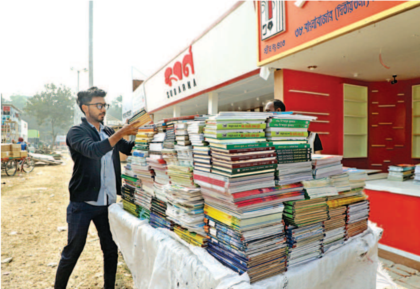
A man stacking books for a stall as part of the last-minute preparations for this year's Ekushey Boi Mela, which begins today at the capital's Suhrawardy Udyan. The photo was taken yesterday.