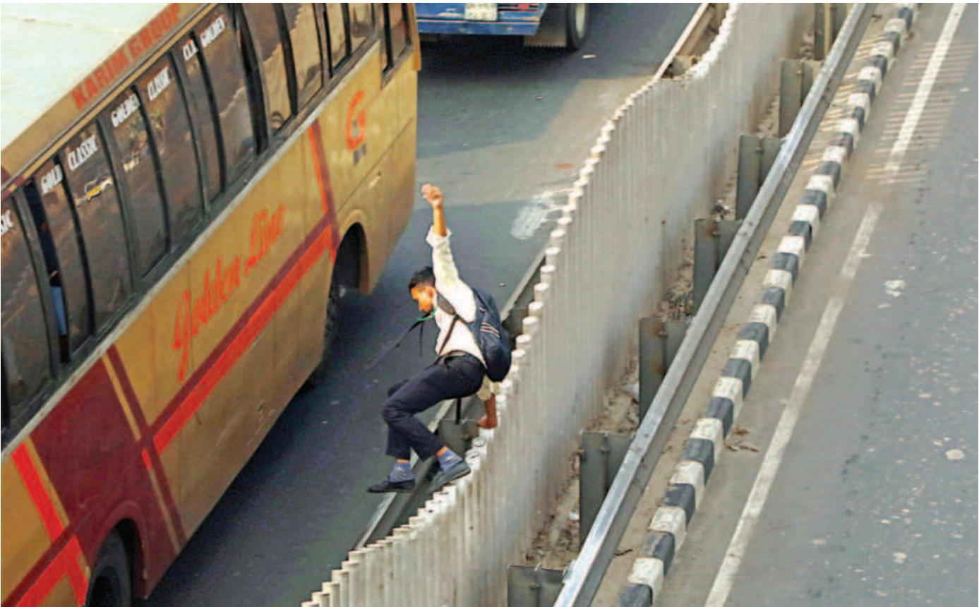
A man climbs over the barrier of the central reservation on the Padma Bridge approach road in the capital's Jatrabari to cross to the other side. Though there is a footbridge, not in picture , just a few yards away, he put himself in harm's way to get there. The photo was taken on Monday.