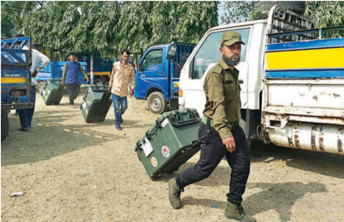
Electoral materials are being dispatched to different polling centres from the assistant returning officer's office in Ashuganj yesterday on the eve of by-polls to Brahmanbaria-2. By-elections to six parliamentary seats, including Brahmanbaria-2, are being held today.