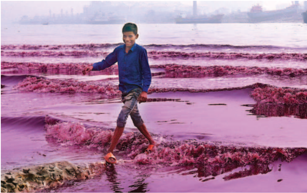
THE BURIGANGA DY( E)ING ... A boy flashes a smile as he walks on the banks of the Buriganga, blissfully oblivious to the harmful chemical dye that has turned a portion of the river pink. The continuous discharge of industrial and chemical waste from nearby factories has been killing the river for years. The photo was taken yesterday in the capital's Shyampur area.