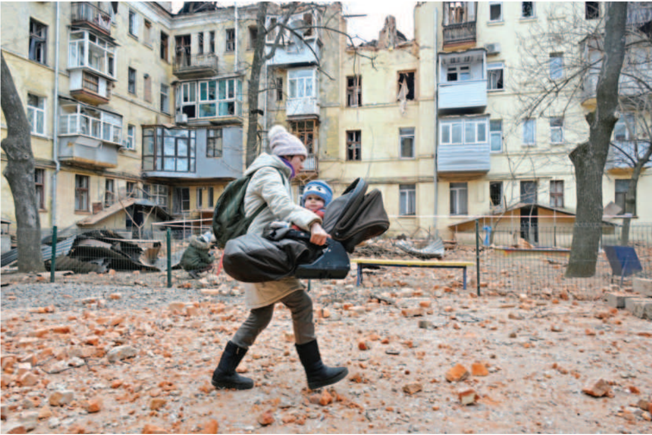
A local resident carries her baby outside of their residential building partially destroyed after a missile strike in Kharkiv yesterday, amid the Russian invasion of Ukraine.