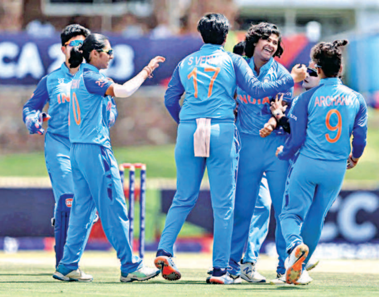
India players celebrate the dismissal of an England batter during the final of the inaugural ICC Women's U-19 T20 World Cup in Potchefstroom yesterday. India won the final by seven wickets, chasing down a 69-run target with six overs to spare.