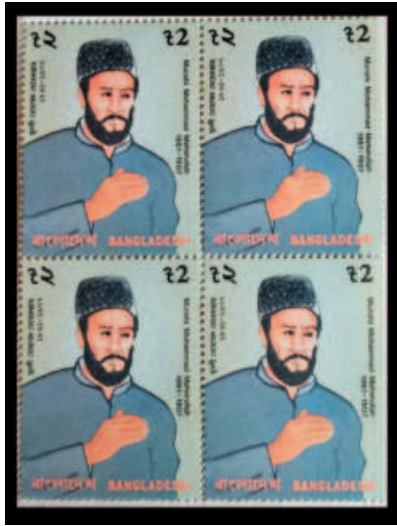
Commemorative stamp honoring Munshi Meherullah

The distinctive approach of Meherullah towards social reform, religion and religious identity played a very important role in defining self and other in Bengal, with important consequences.