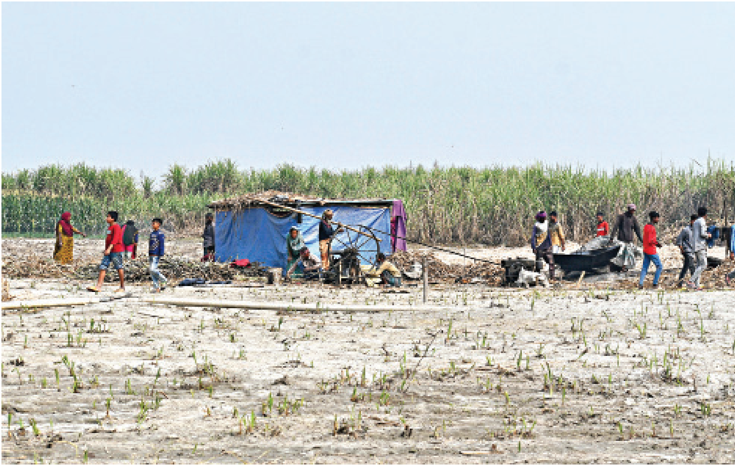
Workers are seen preparing sugarcane molasses from nearby stalks of the plant in Fulchhari upazila of Gaibandha. With the nearest state-run sugar mill currently shuttered, locals have taken it upon themselves to process the natural sweetener, which sells for about Tk 70 per kilogramme. The photo was taken recently.