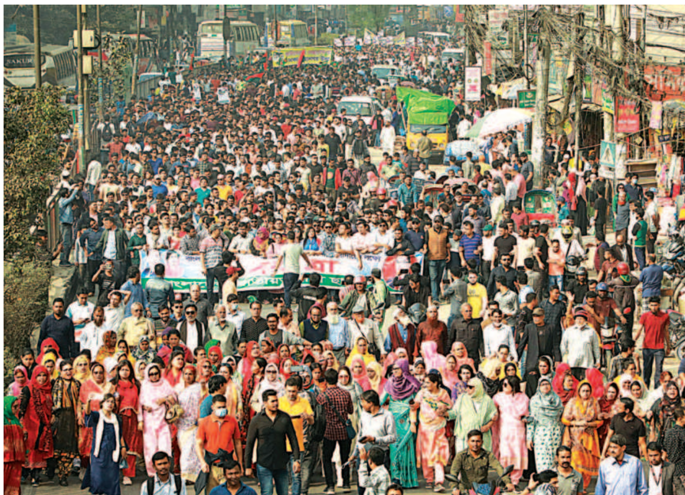
BNP leaders and activists march through Uttara Badda in the capital yesterday to press home their 10-point demand, including a general election under a non-party caretaker government.