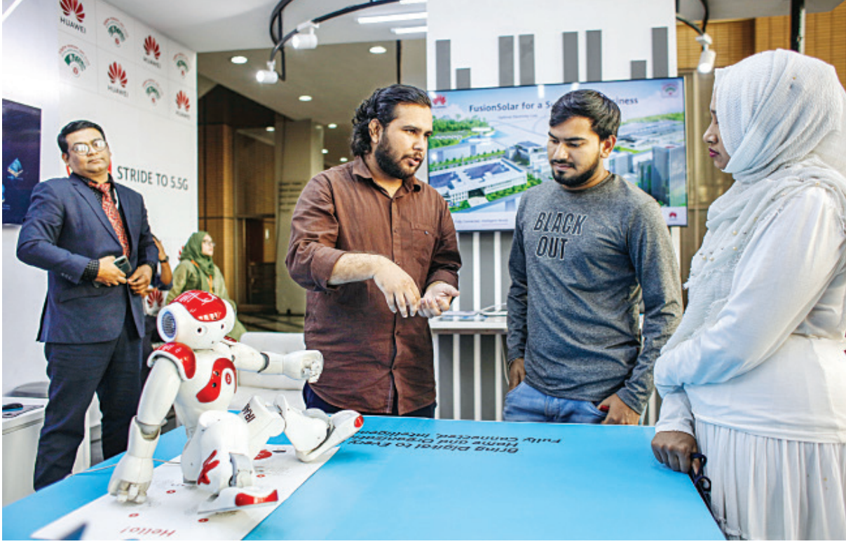
A man briefs visitors about robotics at a stall of the three-day Digital Bangladesh Mela 2023, where more than 50 telecom and ICT companies are showcasing their products and services, at the Bangabandhu International Conference Center in Dhaka's Agargaon yesterday. Story on B2.

UN cuts Bangladesh's growth forecast STAR BUSINESS REPORT The United Nations (UN) has trimmed its forecast on Bangladesh's economic growth to 6 per cent for 2023 from its previous projection of 6.4 per cent as the country's economic situation has significantly deteriorated due to high food and energy prices, monetary tightening and fiscal vulnerabilities. The UN also projected deceleration of global economic growth from an estimated 3 per cent in 2022 to only 1.9 per cent this year, marking one of the lowest growth rates in recent decades. In case of South Asia, the average gross domestic product (GDP) growth is projected to moderate to 4.8 per cent in 2023 from 5.6 per cent in 2022, said the UN in its World Economic Situation and Prospects 2023 released on Wednesday. READ MORE ON B3