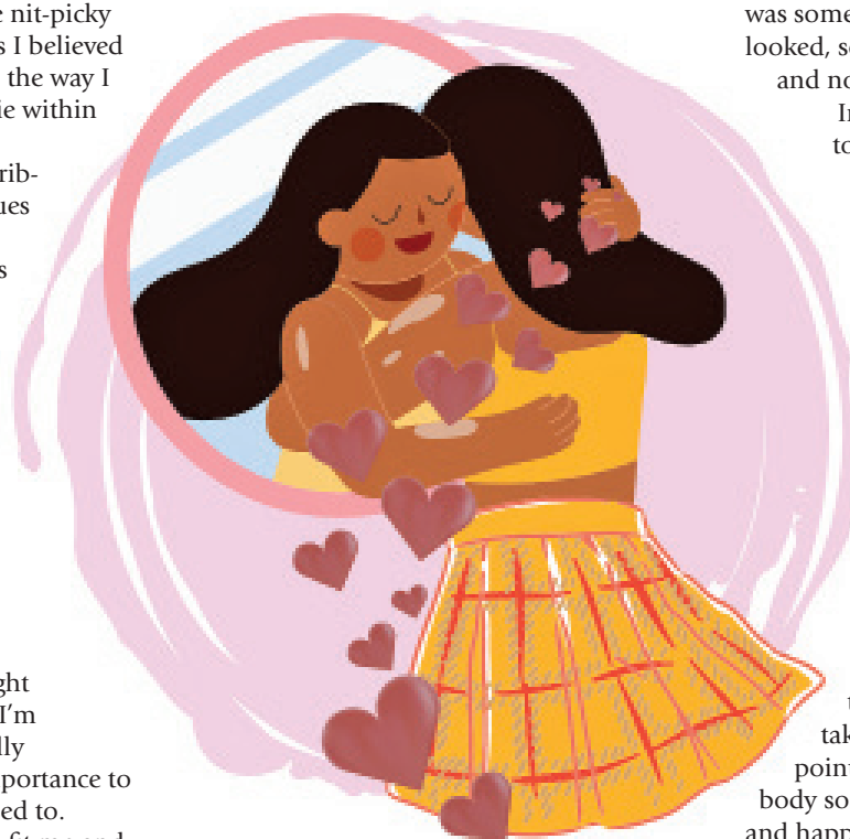
ILLUSTRATION: SYEDA AFRIN TARANNUM

I finally buy clothes that fit me and if something looks a bit odd after trying on, I simply accept that it is either not made for my body type or is simply faulty tailoring. This acceptance has brought me