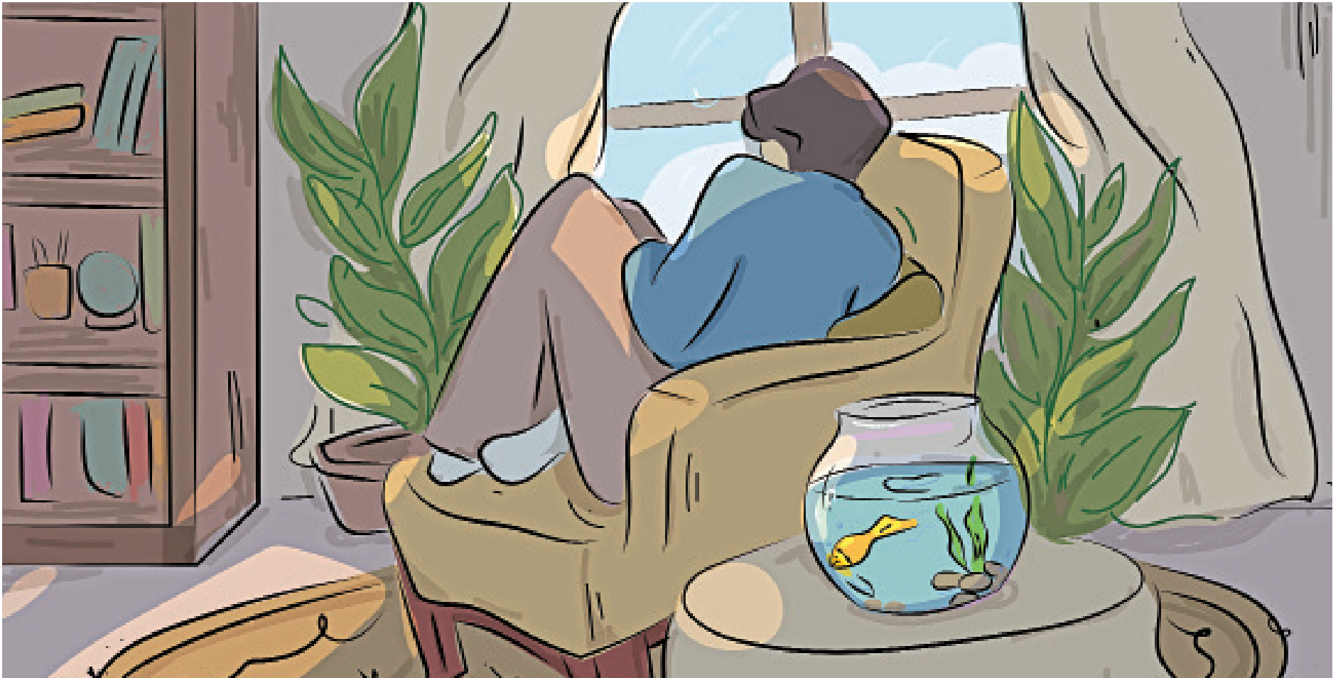
ILLUSTRATION: TUBA TUHRA KHAN