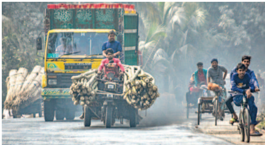
Two three-wheelers, locally known as Nasiman, with oversized loads running on the Dhaka-Khulna highway in Bagerhat's Fakirhat upazila and a truck tries to get around them. Although the movement of slow-moving three-wheelers on highways is prohibited, such vehicles run on roads putting people's lives at risk. The photo was taken on Sunday.