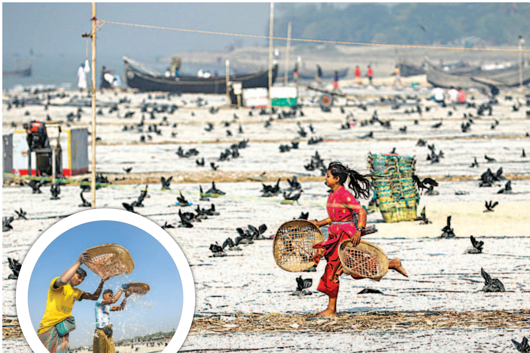
A girl running to bring shrimp that will be dried in the sun on Gahira sea beach of Chattogram's Anwara upazila. Traders buy the shrimp from fishermen to make dry fish (shutki). They then sell this popular food item for Tk 120-300 a kg to retailers. The photo was taken recently.