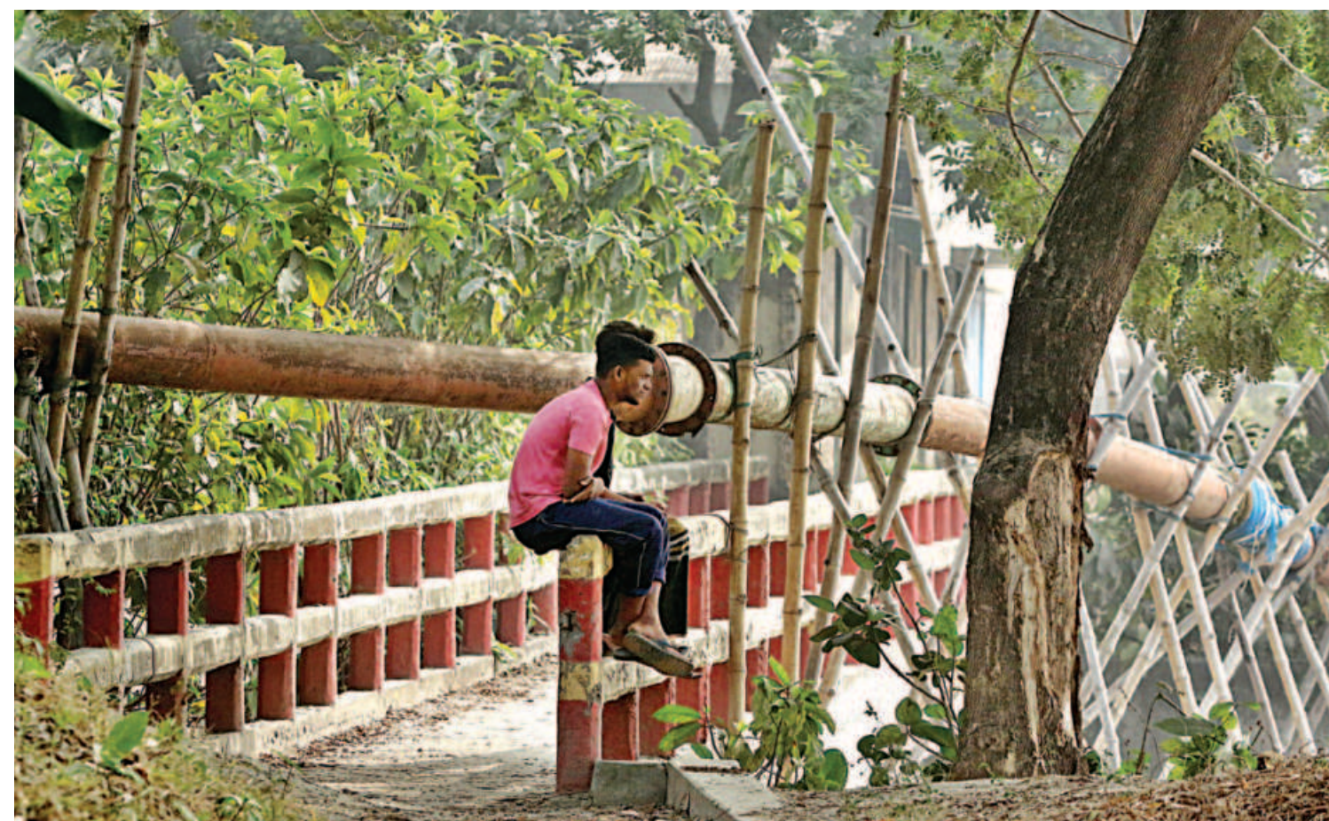
A metal pipe set up over the walkway along the Buriganga, hindering movement of pedestrians. Traders use engines to illegally unload sand from vessels and pump it to the shore through this pipe. The authorities seem to have turned a blind eye. The photo was taken from Aliganj in Narayanganj's Pagla area recently.