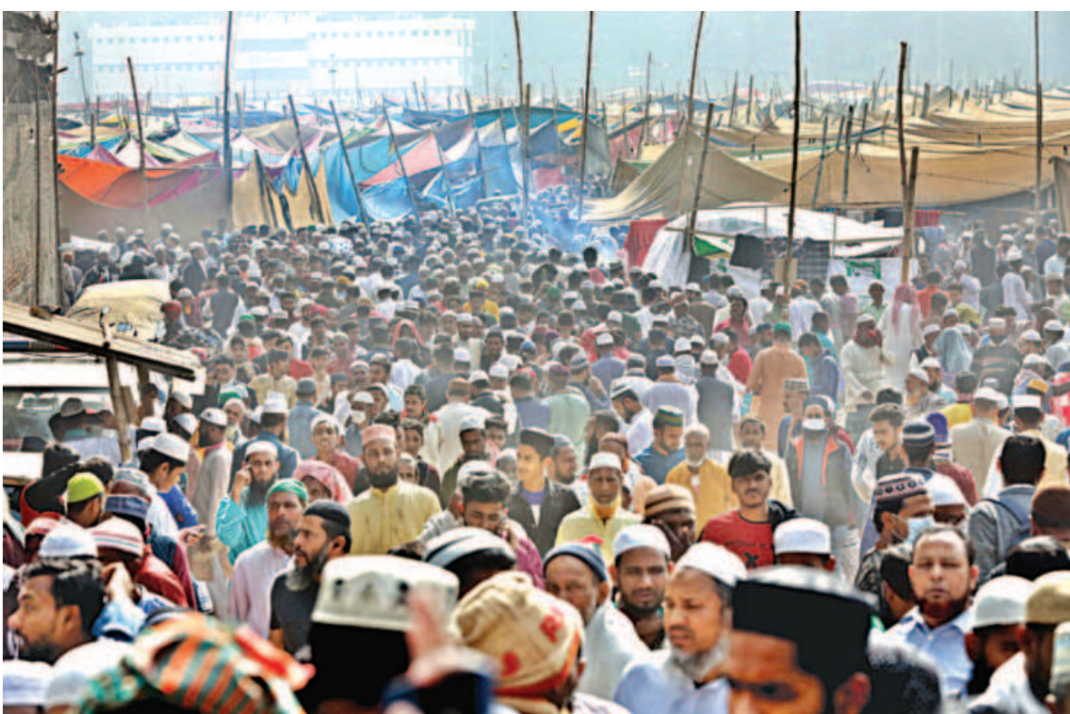
In droves, devotees enter the Biswa Ijtema ground on the Turag in Tongi yesterday, the first day of the second phase of the religious congregation. The Ijtema, known as the largest annual Islamic event after the Hajj, is expected to end after the Akheri Munajat tomorrow.

Bangladesh currently has the largest ongoing programme supported by the World Bank Group's International Development Association (IDA).