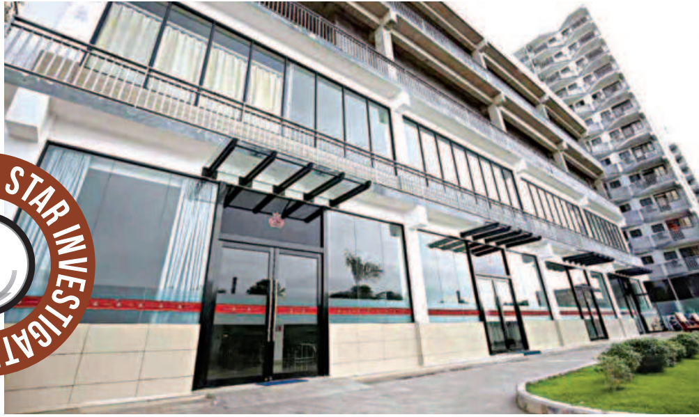
A cyber-slave compound in Sihanoukville, Cambodia. The building's deceptively bright facade belies the dark secrets within.

The job did change his life, but not in the