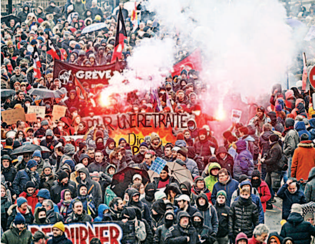
Demonstrators march with banners and flares during a rally called by French trade unions in Nantes, western France yesterday, as workers go on strike over the French President's plan to raise the legal retirement age from 62 to 64.

New Zealand will choose its next prime minister in a general election held on October 14, Ardern announced.