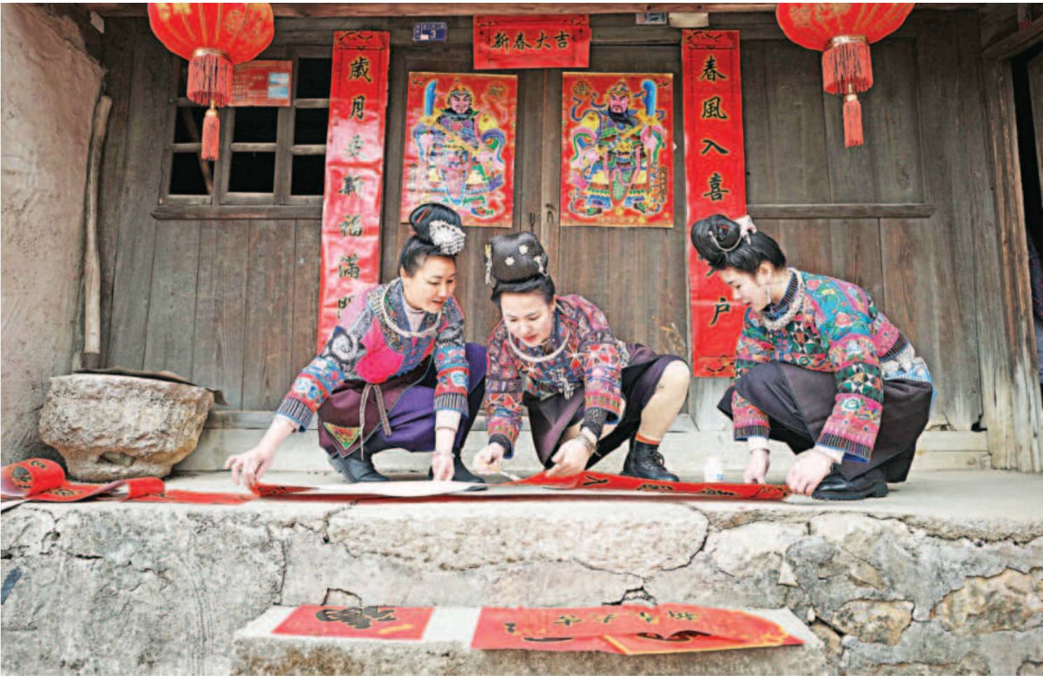
Women of the Miao ethnic minority prepare decorations ahead of the Lunar New Year of the Rabbit in Danzhai county, Qiandongnan Miao and Dong Autonomous Prefecture, in China's southwestern Guizhou province, yesterday. The number of Covid patients needing critical care in China's hospitals has peaked, health authorities said yesterday, as millions travelled across the country for long-awaited reunions with families, raising fears of fresh outbreaks.

During his two-day visit, his third to Sri Lanka since 2021, minister Subrahmanyam Jaishankar will look to strengthen India's ties with its debt-ridden neighbour and sign several key deals.