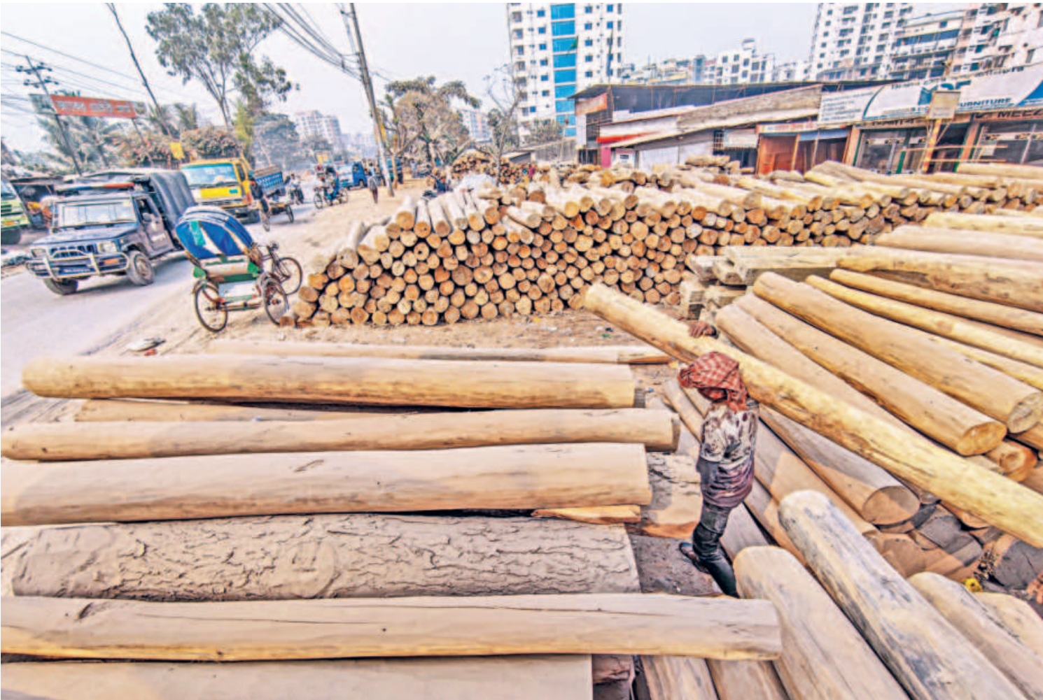
Timber traders have illegally occupied a side of the road alongside Mohammadpur Beribadh with logs, significantly narrowing the walkway. As a result, pedestrians are forced to walk on the road due to this menace. The photo was taken recently.