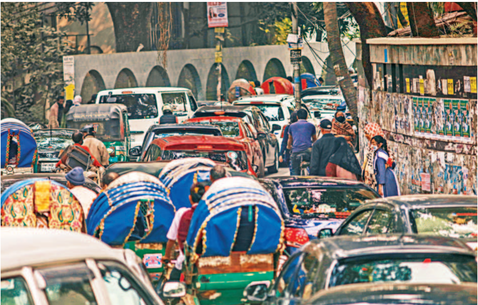
School hours are a nightmare for Dhanmondi commuters amid the many educational institutions situated in the area. During this time, private cars, rickshaws, and CNG-auto rickshaws remain stranded in long queues and move at a snail's pace. This photo was taken yesterday.