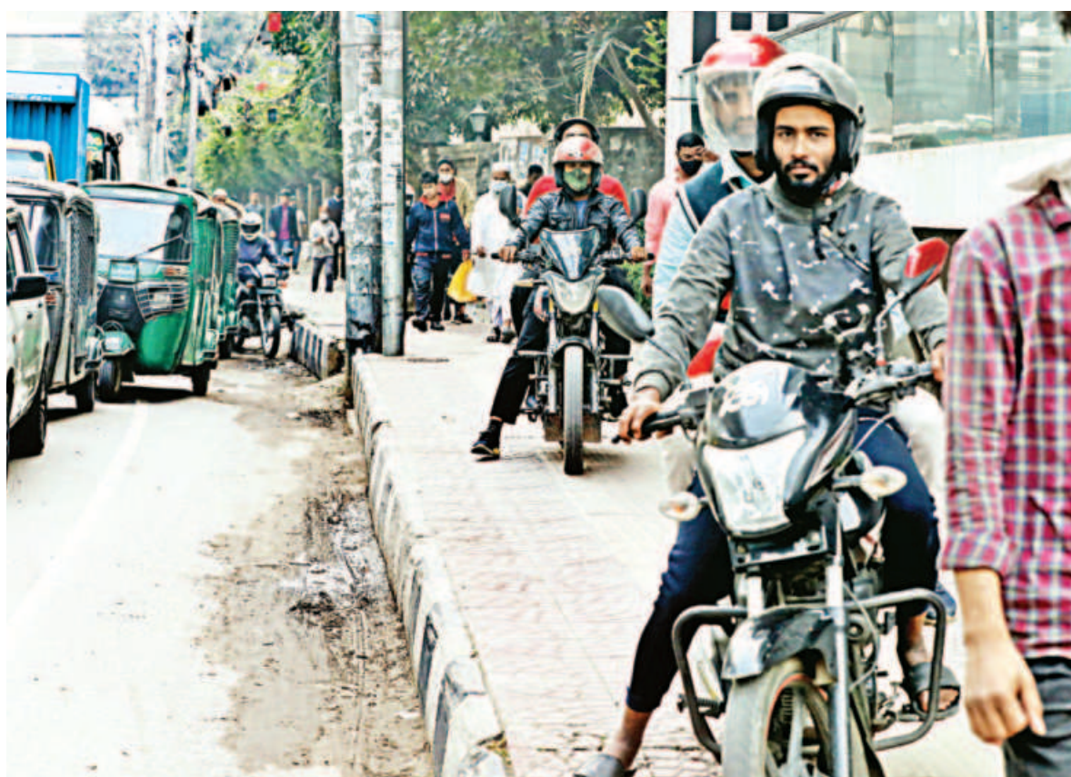
Despite space being there on the street, motorbikes take to the pavement in the capital's Bangla Motor area yesterday. Bikers often seen getting on the pavements putting pedestrians and even themselves at risk.