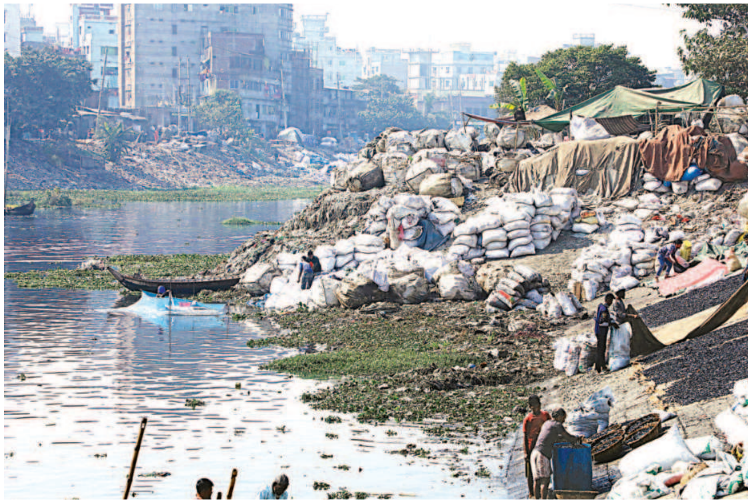
Recycled materials are piled up on the bank of the Buriganga. Despite repeated warnings and even eviction by the BIWTA, recyclers keep using the bank, which leads to some of the materials ending up in the river, polluting the lifeline of Dhaka. The photo was taken in Kamrangirchar yesterday.