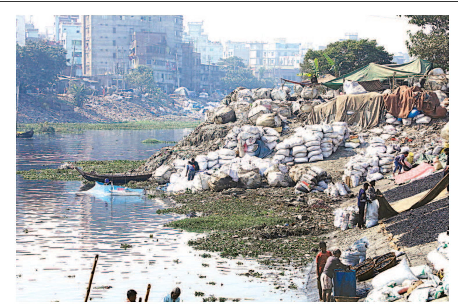
Recycled materials are piled up on the bank of the Buriganga. Despite repeated warnings and even eviction by the BIWTA, recyclers keep using the bank, which leads to some of the materials ending up in the river, polluting the lifeline of Dhaka. The photo was taken in Kamrangirchar yesterday.

State Minister for Planning Shamsul Alam said the PM asked all to remain cautious about expenditure and maintain austerity. She also urged all to ensure their participation in boosting the country's production SEE PAGE 6 COL 1