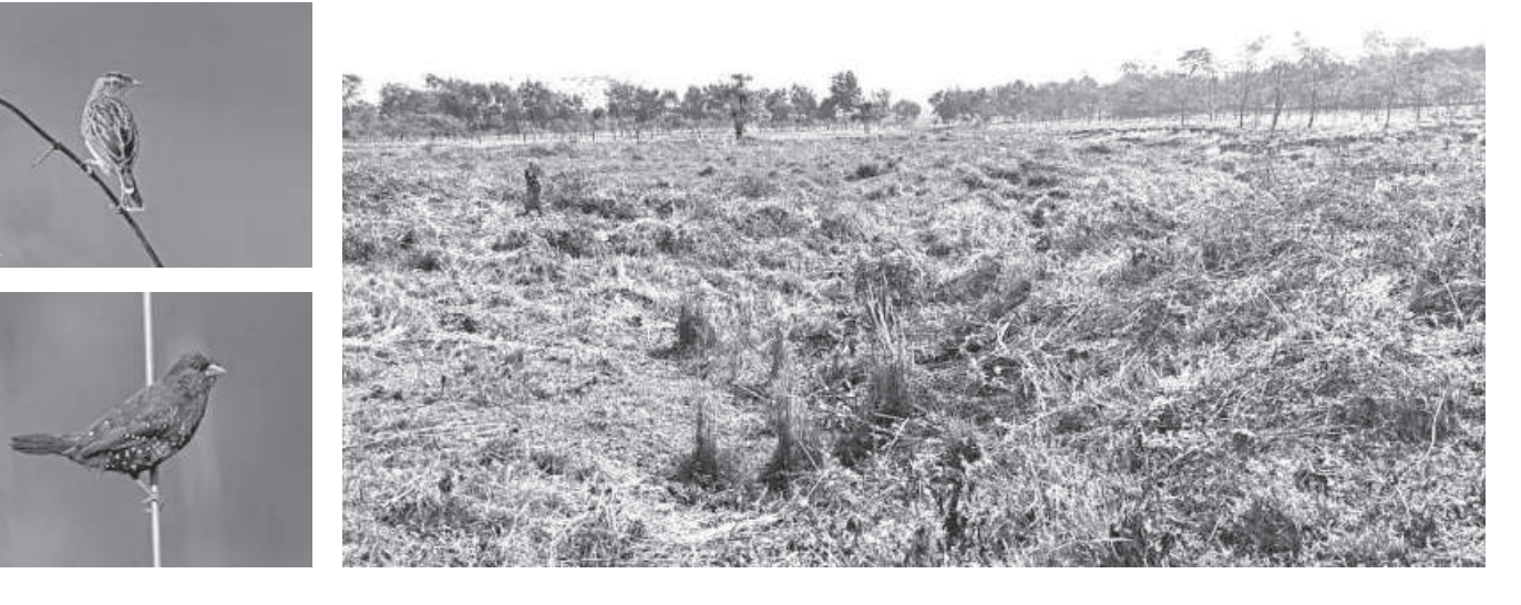
This vast land in Moulvibazar's Kurma Chonkhul area used to be the habitat and sole breeding ground for many rare species of birds and animals. The area has been cleared of the bushes and trees to set up a tea garden instead.