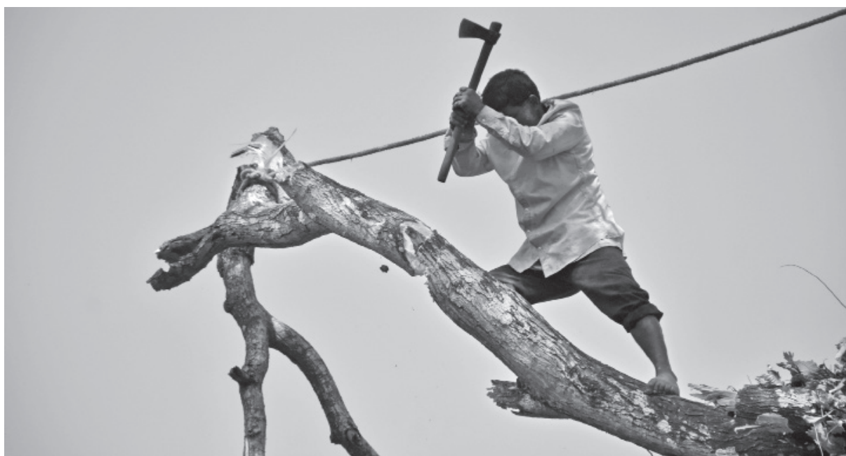
In order to widen Dhaka-Barishal highway, the authorities have decided to cut trees on the side of the road. Although there's a rope to ensure that the branch doesn't fall on the road and injure passers-by, there's no harness to save the man cutting the branch from a deadly fall. This photo was taken recently.