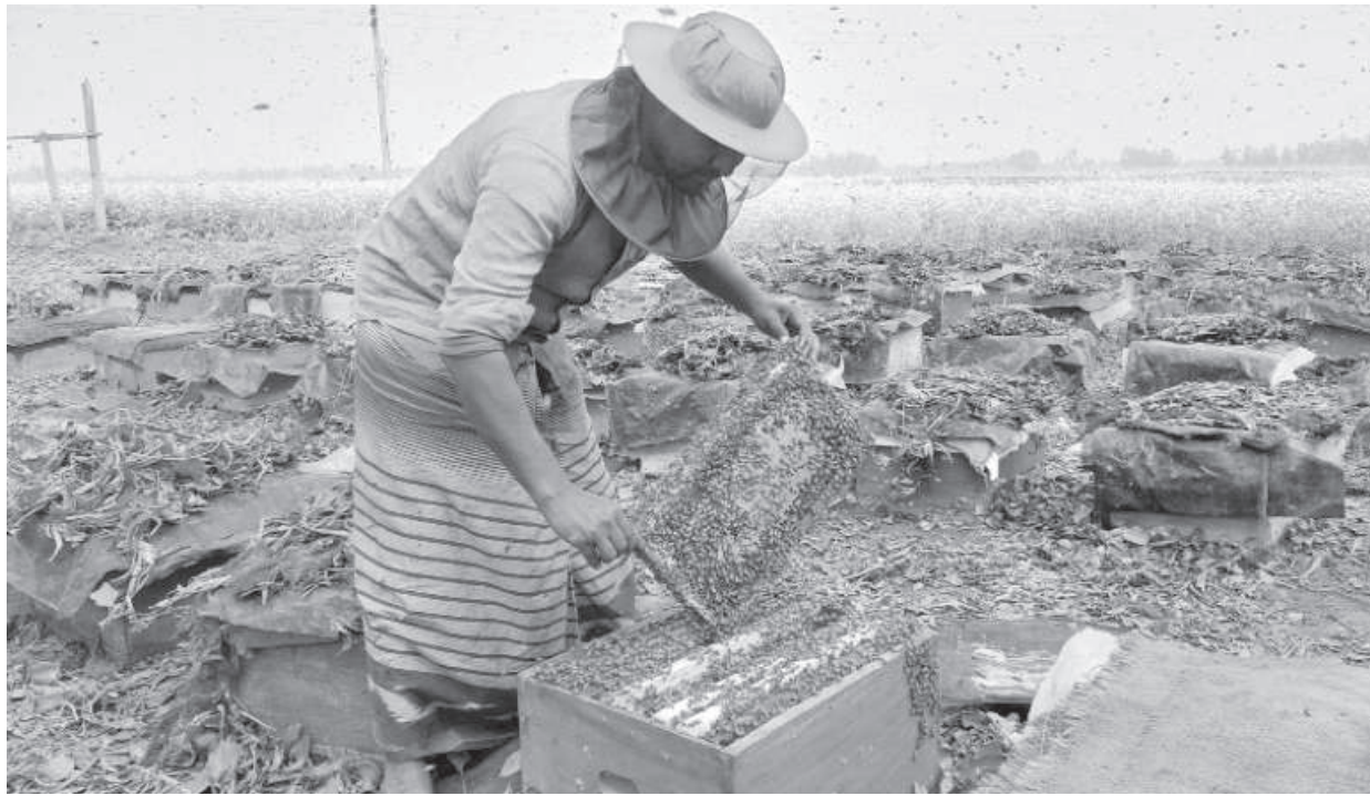
When winter arrives and mustard flowers are in bloom, they bring new hope to the lives of Tangail beekeepers, who harvest honey from the flowers. However, this year due to unfavourable weather conditions, syndicates and the rising price of commodities, beekeepers have only received half of their expected yield, putting them in a financial crisis for the year.