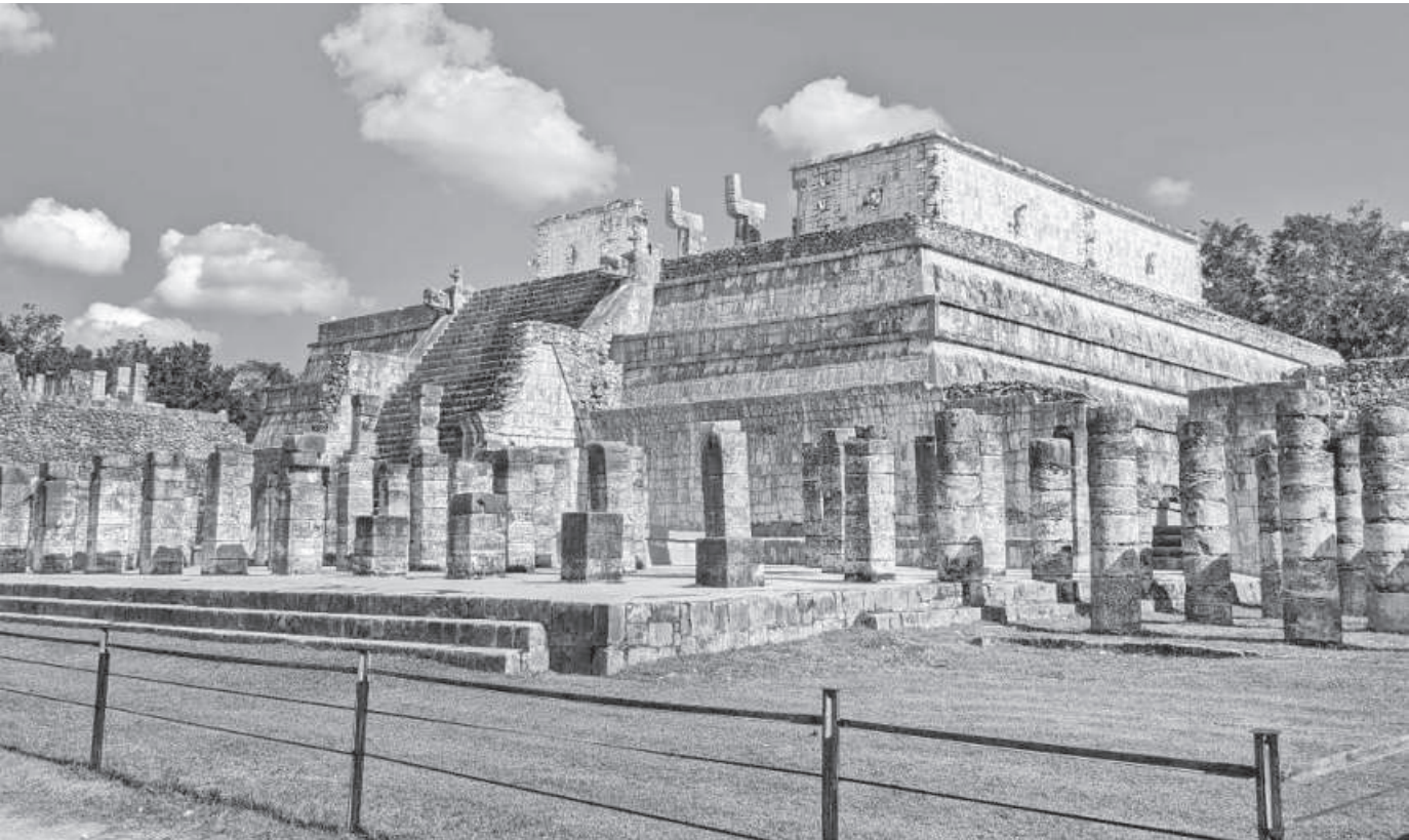
Historical documents indicate that the greatest minds of the time met at the Temple of the Warriors to accurately predict the dates of eclipses by using the Mayan calendars.