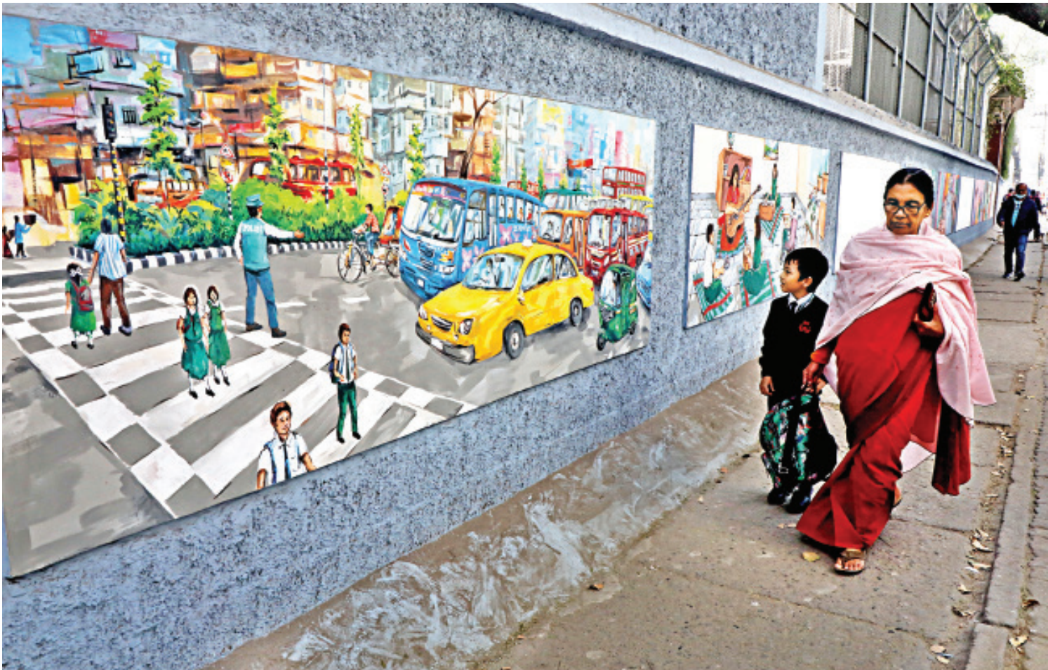
OUT-OF-SCHOOL LESSONS ... A student observes the murals painted on the boundary walls of SFX Green Herald International School in the capital's Mohammadpur, on his way back home with his mother yesterday afternoon. The authorities of the school have put up the murals to teach children about how to be good citizens -- such as following traffic rules, taking an interest in the arts, planting trees as part of saving the environment, assisting the elderly etc.