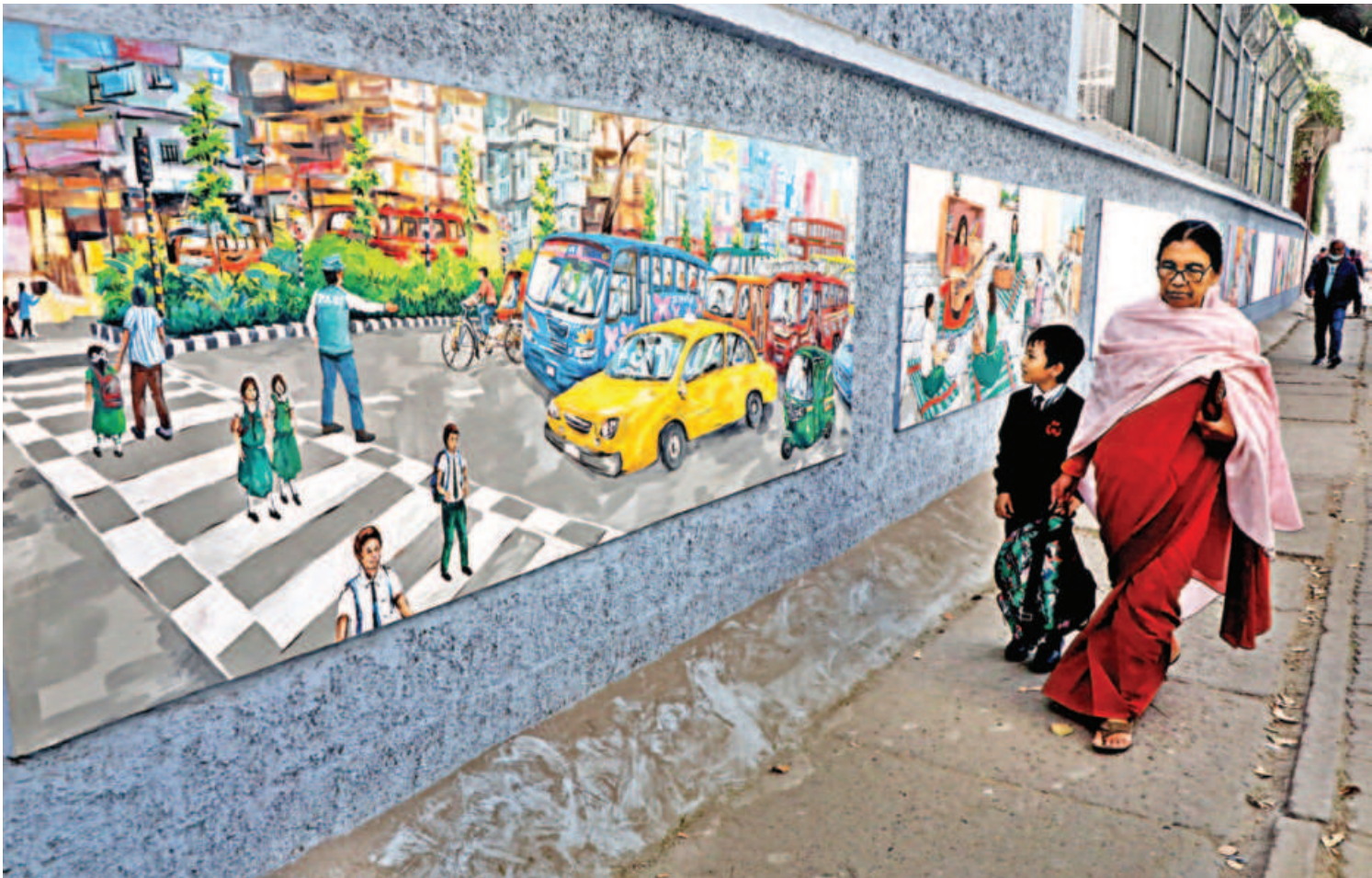
OUT-OF-SCHOOL LESSONS ... A student observes the murals painted on the boundary walls of SFX Green Herald International School in the capital's Mohammadpur, on his way back home with his mother yesterday afternoon. The authorities of the school have put up the murals to teach children about how to be good citizens -- such as following traffic rules, taking an interest in the arts, planting trees as part of saving the environment, assisting the elderly etc.