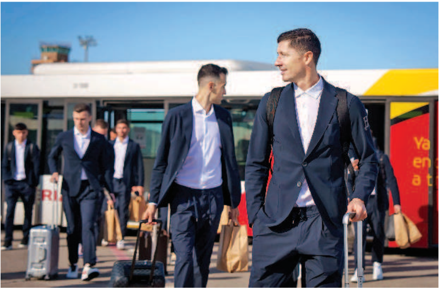
Robert Lewandowski led the Barcelona contingent as they arrived in Riyadh ahead of their Spanish Super Cup semifinal against Real Betis at the King Fahd International Stadium tonight.

And in Rashford, Ten Hag has a determined and dependable forward as United look to consolidate a top-four spot and return to the Champions League.