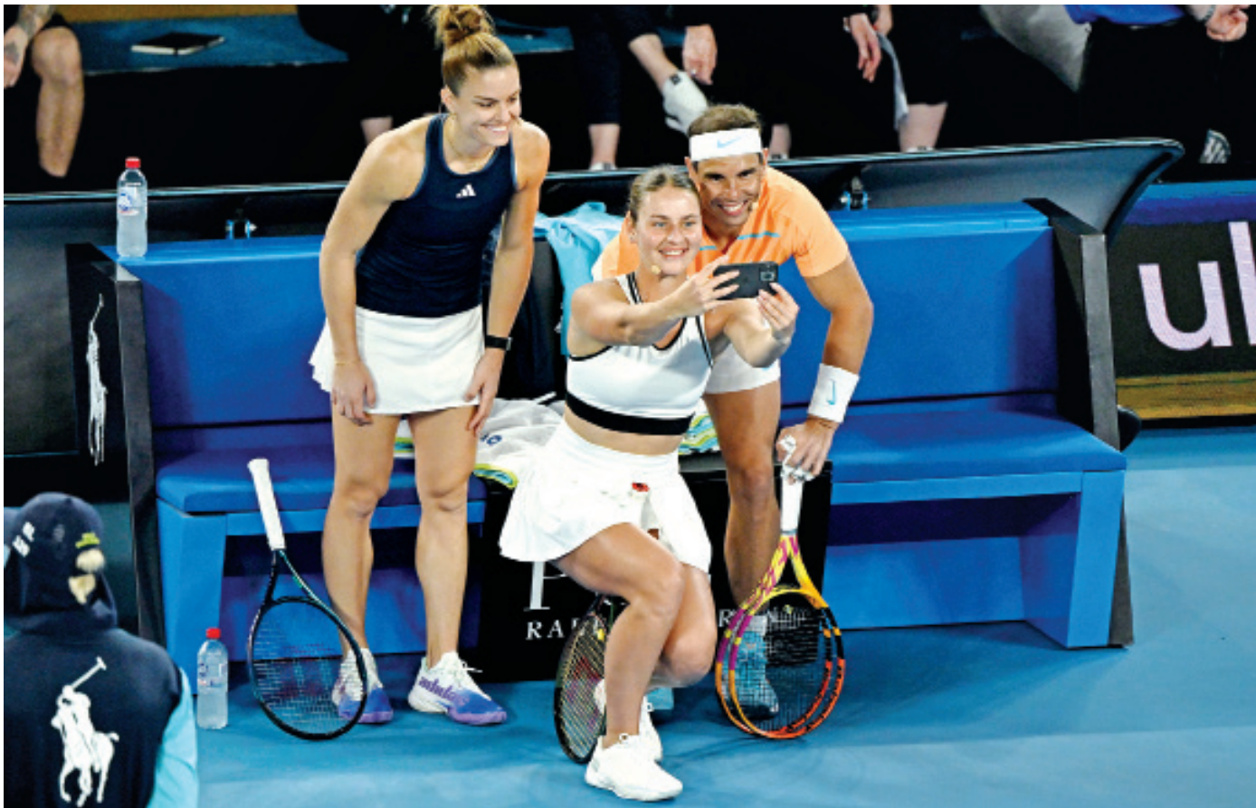
Rafael Nadal battled back from regular injuries to lift the Australia Open last year for a record 21st Grand Slam title before adding the French Open crown to his collection. Yet, there are concerns whether he has lost a step after losing six of his past seven matches. What he still has in spades, however, is his star power, with Maria Sakkari (L) and Marta Kostyuk rushing to take a selfie with the 36-year-old after a charity match yesterday ahead of the Australian Open in Melbourne.

While any fiery remarks have been put on hold, when the action takes to the field at Chattogram, it remains to be seen whether Shakib will go from ‘break’ to action again.